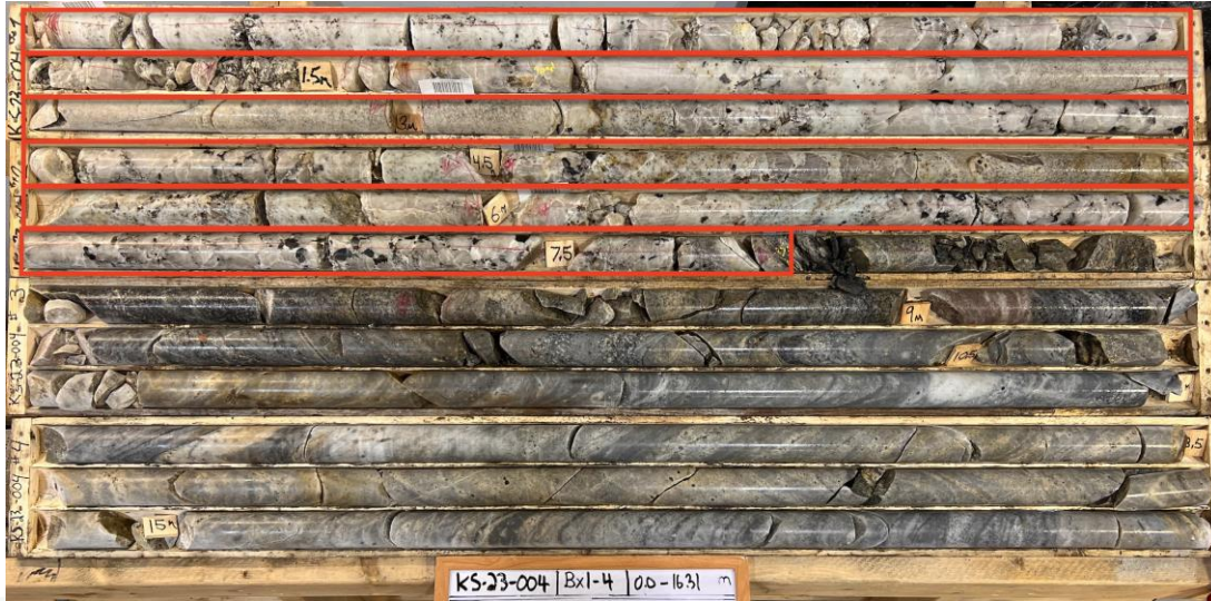
Figure 2 – Core boxes containing spodumene mineralisation in hole KS-23-004

Balkan notes that the most recently completed hole at Koshman – KS-23-009 – has encountered ~16.8m of visual spodumene mineralisation from 5.8m to 22.7m.