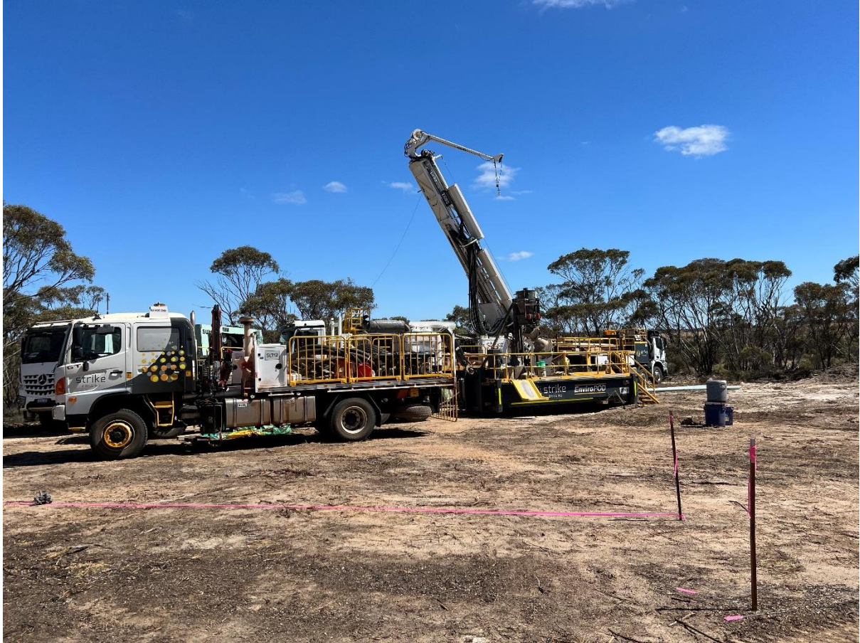
Drilling for lithium at the Mt Short JV project