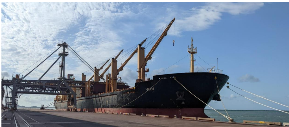
Peko's first shipment at Darwin Port. Elmore loaded approximately 22,500 wet metric tonnes of product into this ship.

Late in December 2022, operations were impacted by the "1 in 100 year" rainfall associated with Tropical Cyclone Ellie. This delayed the second shipment through the sheer amount of water restricting heavy vehicle movements on site and site access. During this forced shutdown period, the group took the opportunity to complete further process plant ramp up steps and completed a range of plant enhancements to improve production volumes and operational consistency.