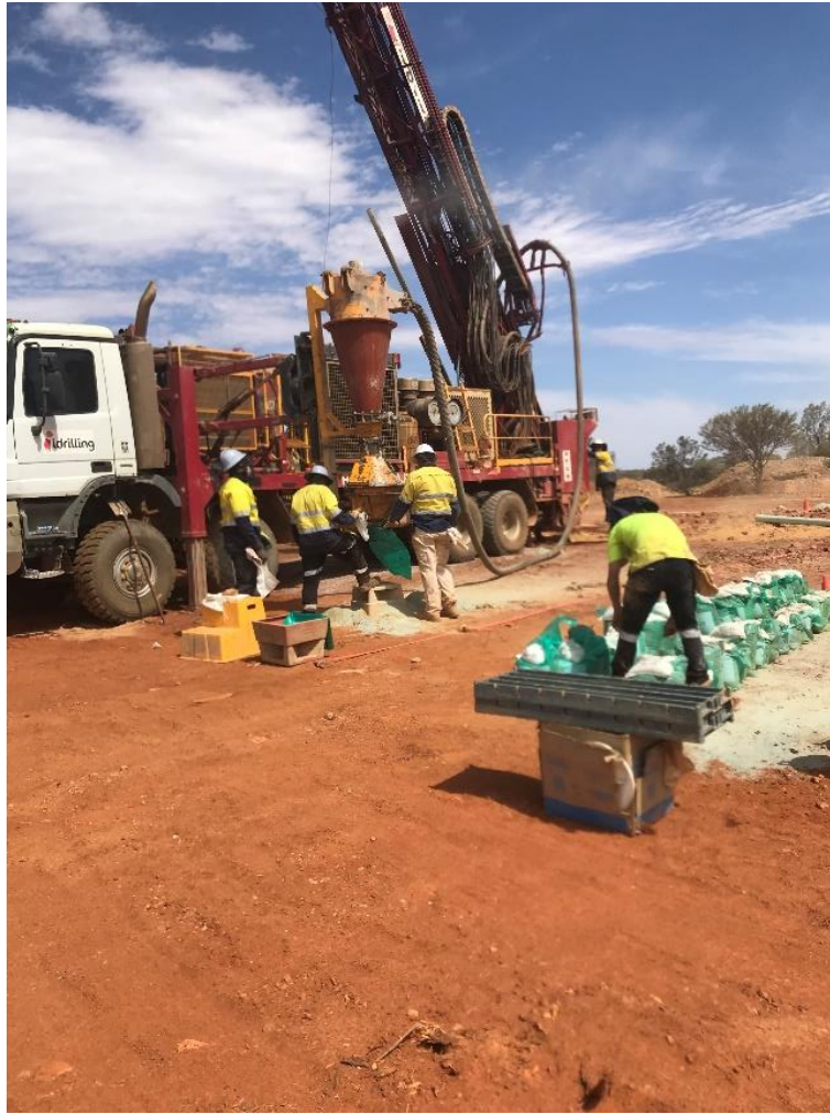
Figure 2: RC drill rig in operation at Queen Alexandra Prospect

Geological observations made during the drilling program of the historical workings and logging indicate that in addition to the subvertical, east-west striking veins seen at surface, flat north dipping structures plunging to the south-east also appear to be a major mineralised component. A geological interpretation together with a JORC Resource will be completed on receipt of the 228 x 1m assays. This structural interpretation will ultimately require substantiation for deeper mineralisation through diamond drilling. Diamond drilling will also provide further metallurgical and geotechnical information for future mineral resource estimation work. The Company will consider the opportunity for diamond drilling in the first quarter of 2024.