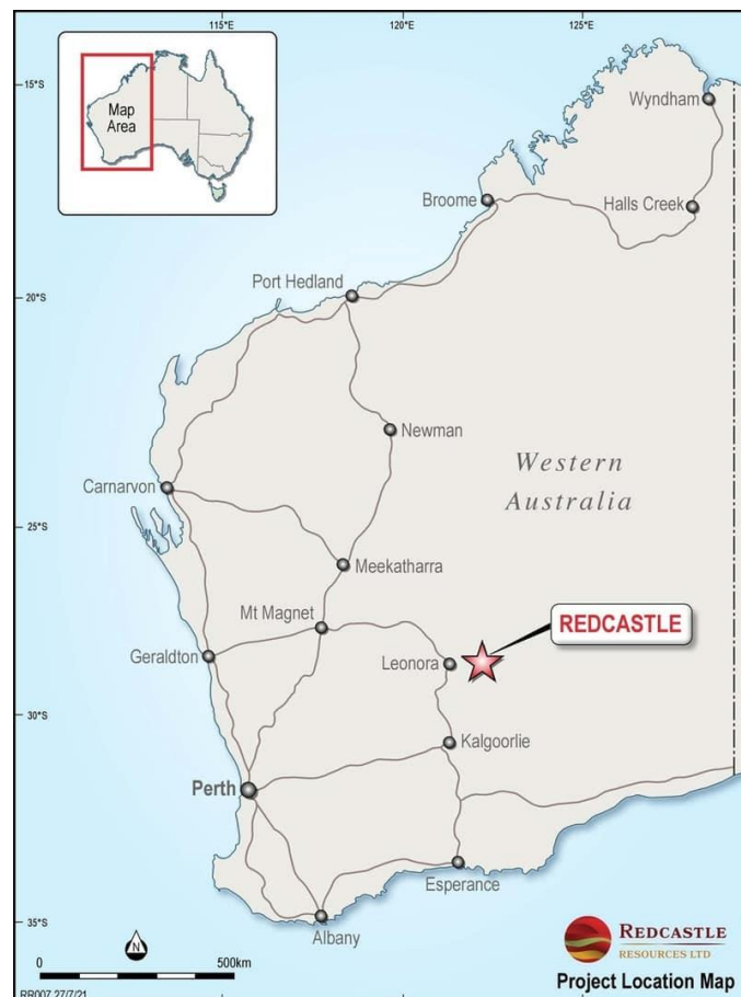
Figure 1: Redcastle Project - Location Plan