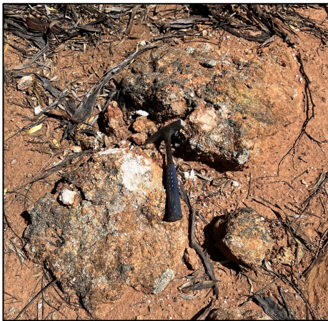
Figure 2. - MYP062 - highly weathered pegmatite grading 1,268ppm Li 2 O

A reverse circulation (RC) rig has been secured and will be mobilised to site to commence drilling in early December targeting fresh spodumene mineralisation.