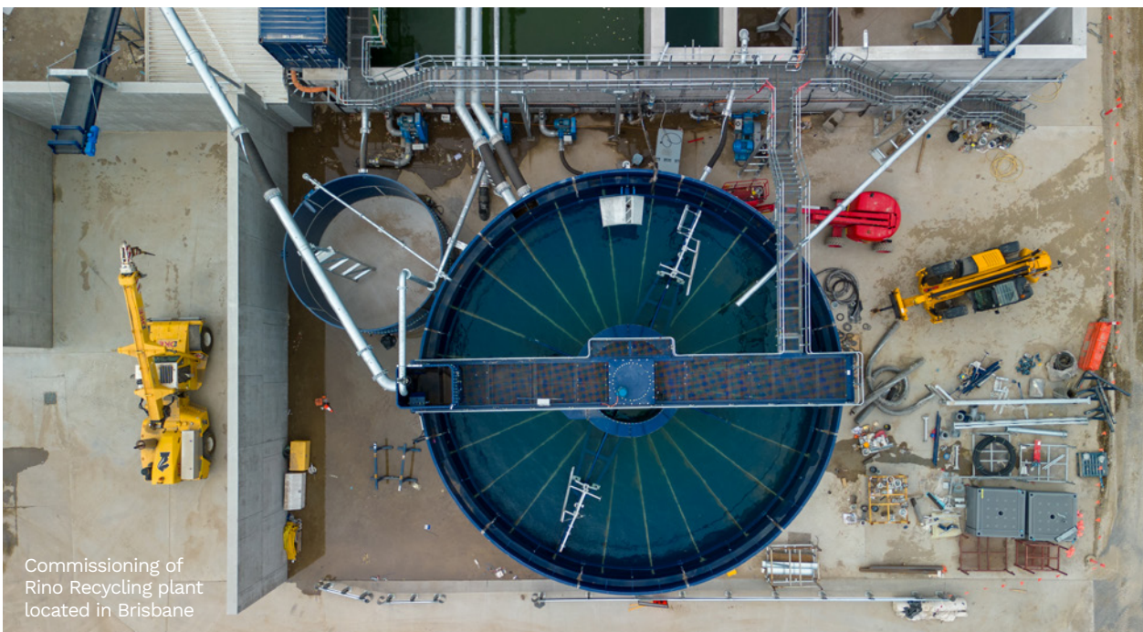
Commissioning of Rino Recycling plant located in Brisbane