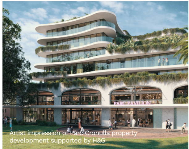
Artist impression of Parc Cronulla property development supported by H&G