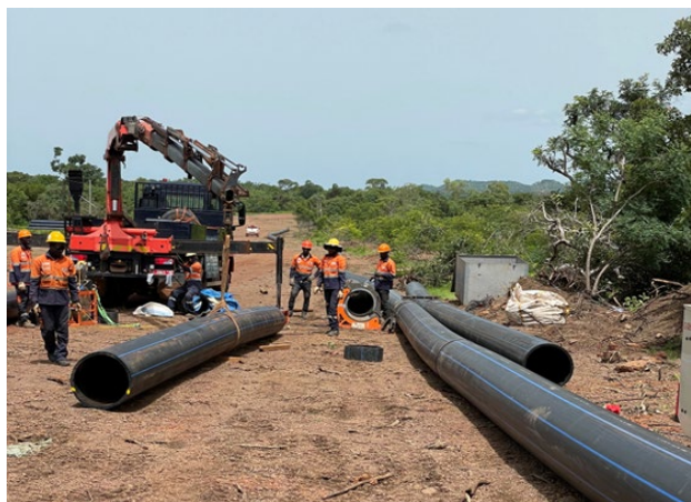
Image 10 - Overland pipe

Overland pipe welding is approximately 35% complete. The permanent accommodation supply and install activities are approximately 85% complete.