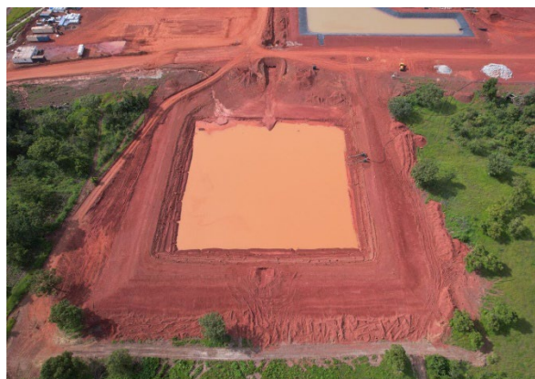
Image 7 - Plant drainage and sediment pond

Concrete in the wet plant continues in advance of the structural mechanical and piping installation. Total concrete poured is approaching 70% of the planned volume.