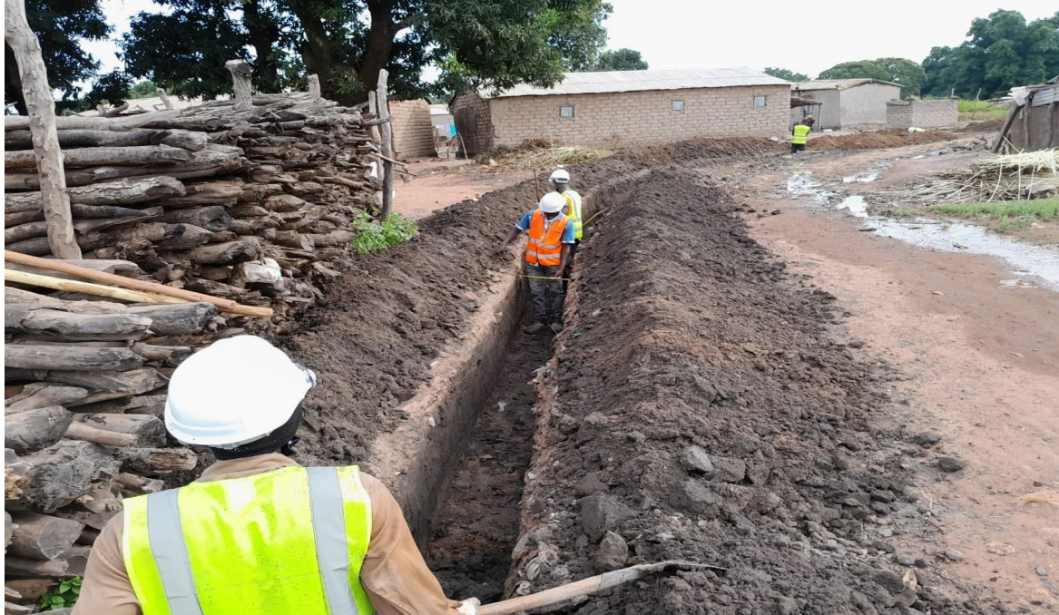
Image 12 - Commencement of the water supply project in Goulamina village

Whilst Leo Lithium acknowledges that direct employment with the project is an important source of income for local communities, it is also developing alternative income generating initiatives within local communities. Work commenced on the development of several new businesses within these communities, that when established, will provide essential goods and services to the Project. Discussions are also taking place with several Malian companies regarding the development of cooperative arrangements to buy agricultural products from local villages, with support provided by the Project to meet quality and quantity requirements.