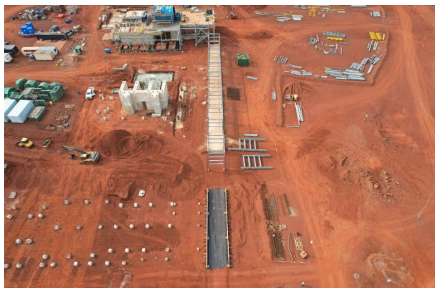
Image 8 - Wet plant and pipe rack