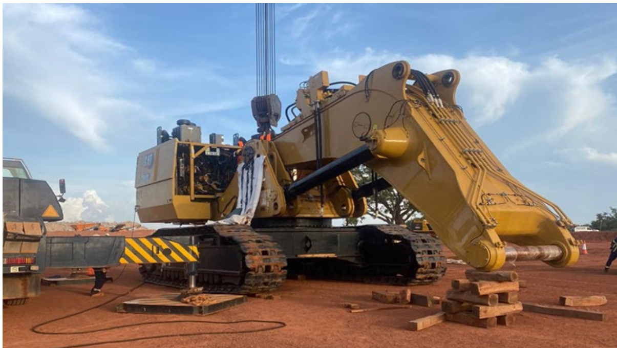
Image 2 - Construction of Cat 6030 Excavator which arrived on site

Mobilisation of Corica Mali's long-term mining fleet has commenced with the arrival of a new Cat 6030 excavator during the quarter. Commissioning of the excavator, the accompanying Cat 777 trucks and ancillary equipment is expected during the December quarter.