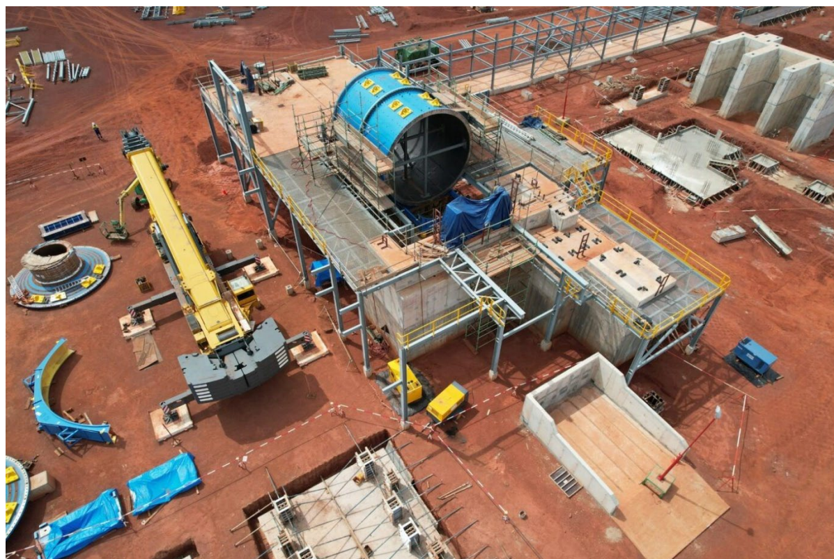
Image 3 - Ball mill site

Mobilisation of personnel and equipment for the ball mill installation was completed during the quarter. Preassembly checking and cleaning have now commenced prior to the installation of main bearing housing and installation of the mill shells.