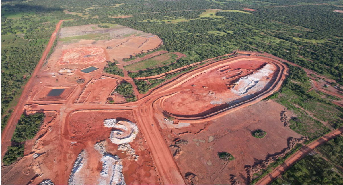
Image 1 - Aerial view of Stage 1 pit, ROM and waste dump

Mobilisation of Corica Mali's long-term mining fleet has commenced with the arrival of a new Cat 6030 excavator during the quarter. Commissioning of the excavator, the accompanying Cat 777 trucks and ancillary equipment is expected during the December quarter.