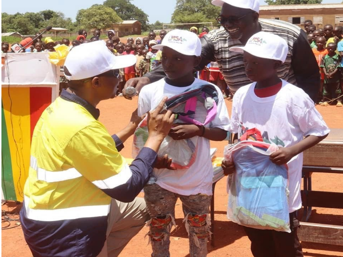
Image 13 - Ceremony to donate back-to-school packs for local school children