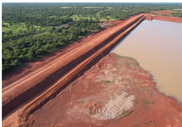
Image 6 - TSF

The bulk earthworks in both the plant and tailings storage facility (TSF) are both materially complete, with final trim activities occurring.