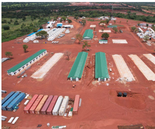
Image 11 - Accommodation