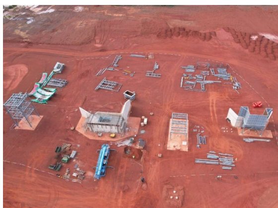
Image 5 - Fine ore bin and reclaim area

The bulk earthworks in both the plant and tailings storage facility (TSF) are both materially complete, with final trim activities occurring.