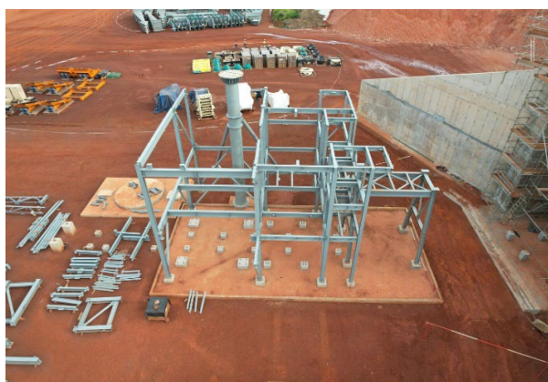
Image 4 - Primary crusher

Engineering and drafting is 95% complete and will be closed out in November with the finalisation of pipeline design. Dry plant concrete is well progressed allowing for the commencement of steel erecting in the facilities of primary and secondary crusher, fine ore bin / reclaim and conveyor transfer stations.