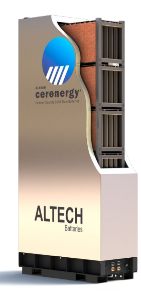
Figure 2 - Cross section of 60 KWh ABS60 showing vacuum-sealed pack and cell frames