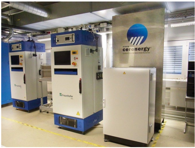
Figure 4 - Completed first stainless-steel casing delivered to Fraunhofer Testing Centre

Following a recent workshop in Germany, Group Managing Director Iggy Tan commented on the optimisation of the battery design and progress of the prototypes and stated "We are extremely pleased with the new stainless-steel design of the 60 KWh batteries. These will be able to operate in the snow, as well as desert conditions, without the finish being affected. The vacuum-sealed casing will provide the perfect insulation and minimise any heat loss, which is the key benefit of our sodium chloride solid-state batteries. The production of the prototype batteries is progressing well. The produced cells are performing well under bench performance testing and it will be great to see the whole 60KWh unit under performance load. This is the first time our partner Fraunhofer has made such a large battery unit".