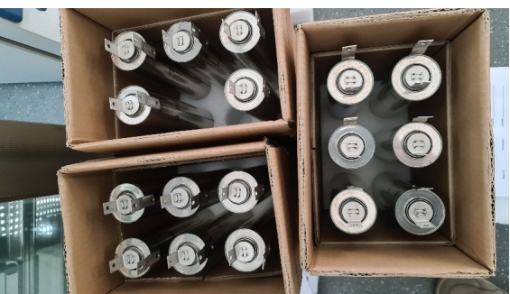
Figure 3 - Production of cells at Fraunhofer Institute