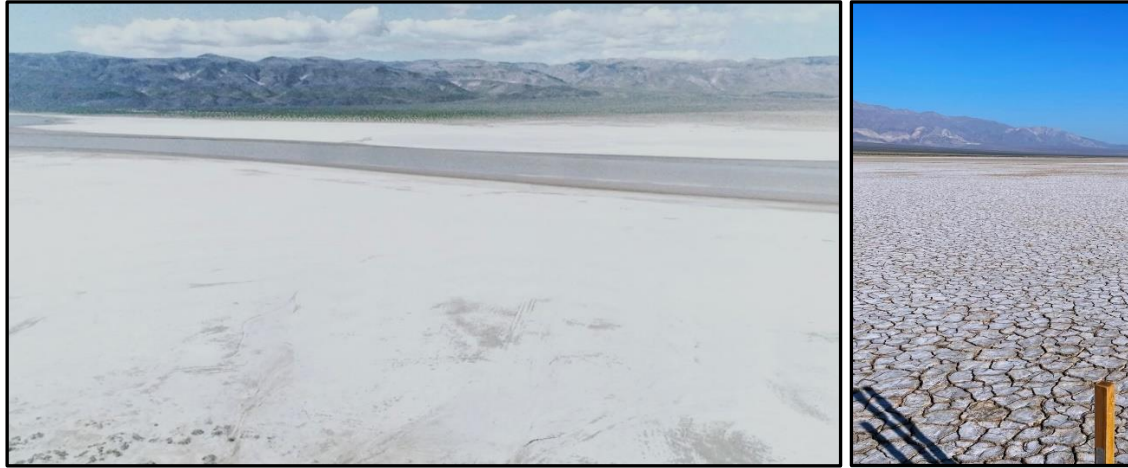
Figure 5: The first drill site- Salt Fire Flat at Liberty Lithium

Authorised by the Board of QX Resources Limited.