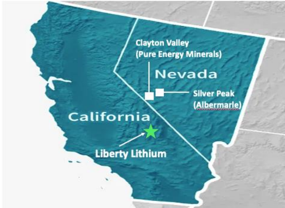
Figure 1: Location map of Liberty Lithium area (SaltFire Flat Project)