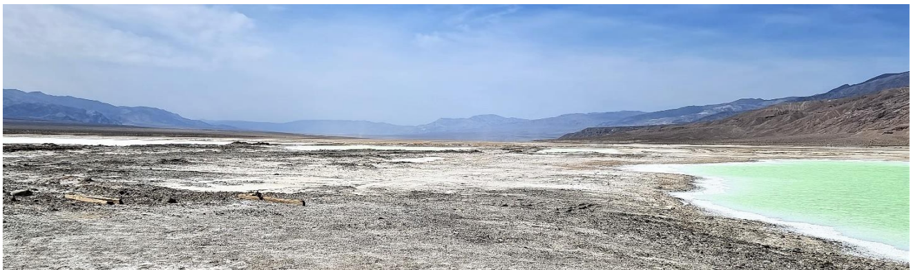
Figure 4: Two views of the Salt Fire Flat at Liberty Lithium