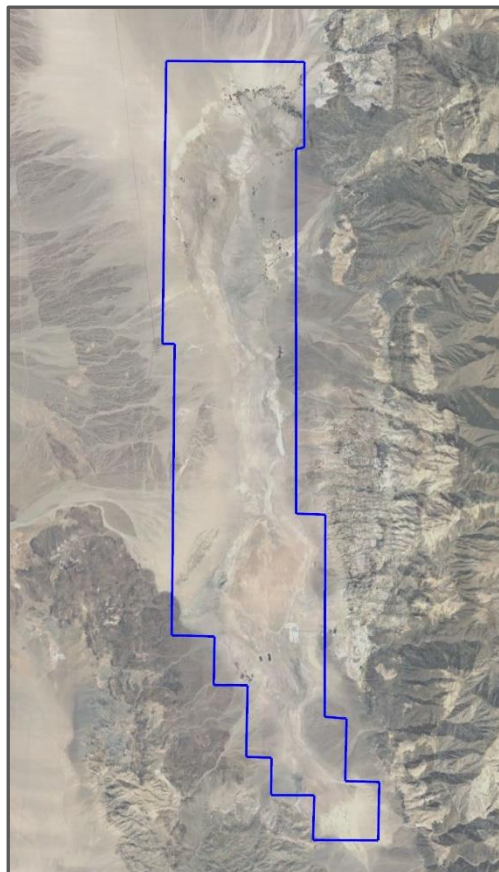
Figure 2: Lease map of Liberty Lithium area covering more than 10,000 Ha (25,000 acres)