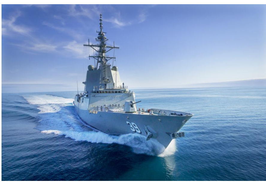
HMAS Hobart - Fluid systems supported and maintained by WATMAR

WestStar plans to integrate WATMAR into its existing operations and retain key management personnel to ensure a smooth transition for customers and employees and position the business for immediate growth and increased profitability.