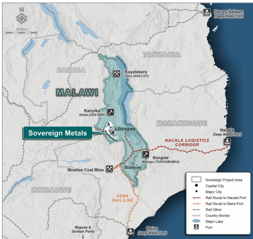
Figure 1: Sovereign's Kasiya project displaying its position in South-East Africa.

The Company's objective is to develop a large-scale, long life rutile-graphite operation, focusing on developing an environmentally and socially responsible, sustainable operation.