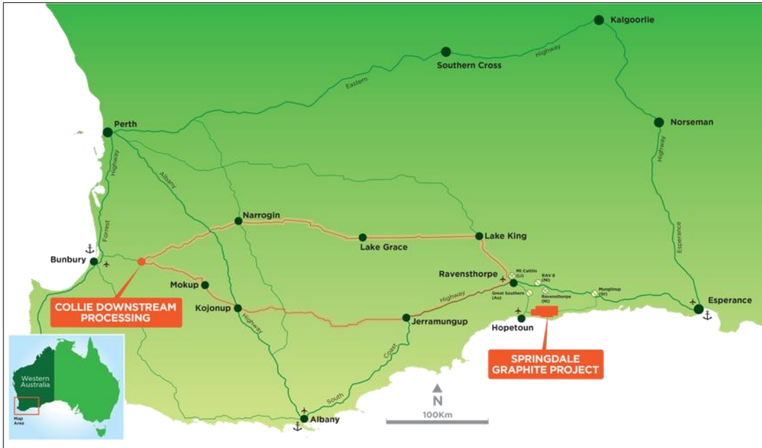
Figure 3: International Graphite project locations

The Company is in the early phases of development, spending $5,2m on exploration & evaluation at Springdale and $1.6m on midstream process development, including $759,000 on graphite processing equipment. The Company reported an operating loss for the 2022-23 financial year of $2,533,229 (2022: $2,055,940) after providing for income tax.