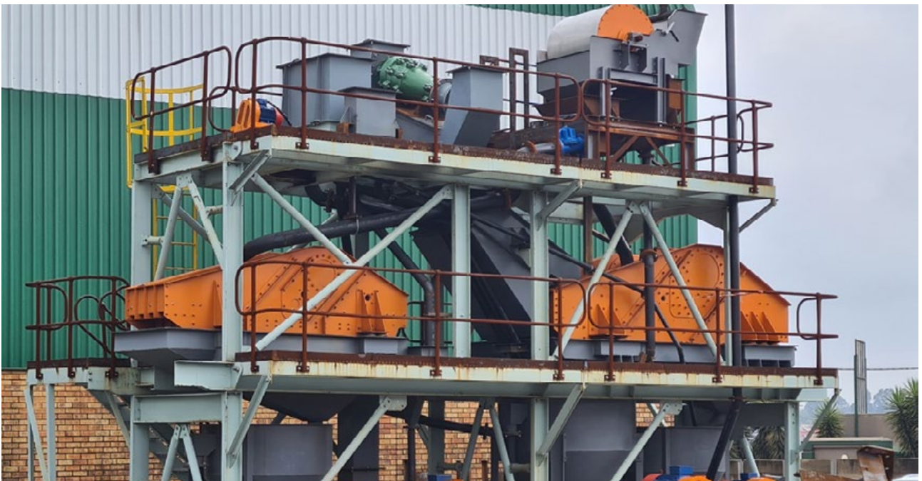
Figure 2: Example Modular DMS Unit

NOTE: The Company discloses that the unit photographed above is not currently owned by the Company or used at the Project, nor is there any certainty that it will be owned or used by the Company in the future.