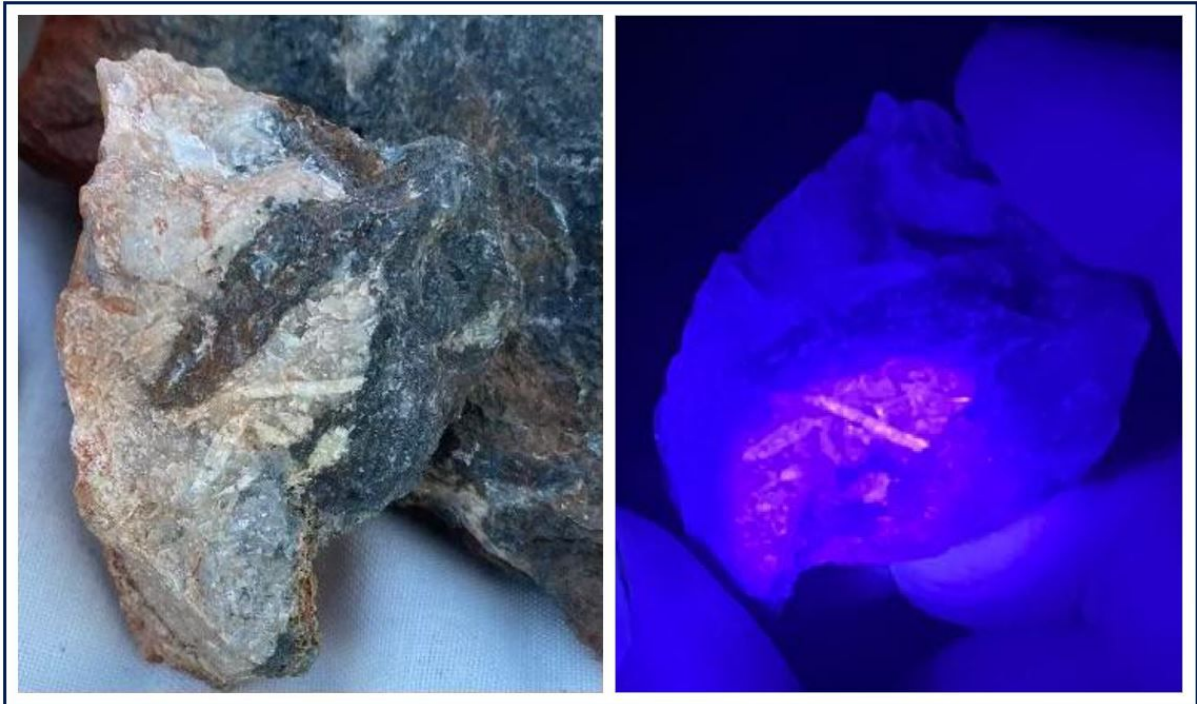
Fig 1 – Hand-specimen of spodumene crystals in LCT pegmatite showing strong pink fluorescence, a characteristic feature under long-wavelength UV light.