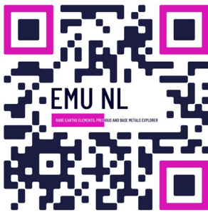
EMU Investorhub QR Code

https://investorhub.emunl.com.au/auth/signup