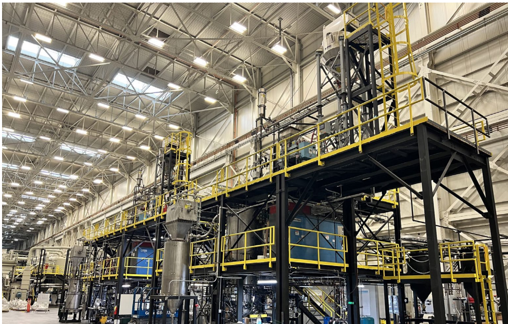
Two Generation 3 Furnace systems and milling equipment installed in NOVONIX's Riverside facility

Production campaigns have been ongoing to provide both operating data and economic insight on this breakthrough technology. In the most recent campaign, material was produced that met all specifications while also reaching the equipment design throughput targets. The Company will continue with production campaigns to collect more operational data and provide mass-production material for sampling to potential customers.