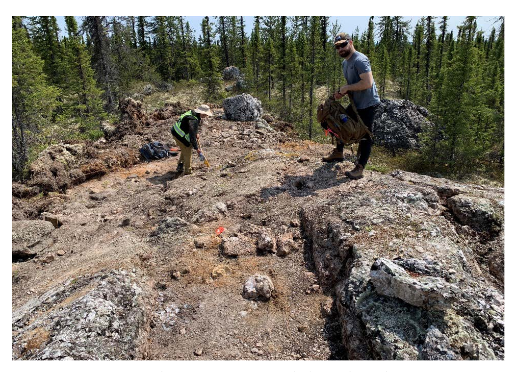
Figure 3. Mikisiw Li-pegmatite outcrop looking to the southeast.

The Mikisiw targets were recently discovered by a brief field mapping season conducted by Benz in May and June of this year. The Mikisiw pegmatite ( M-1 ) outcrops for about 50m but with multiple blocks and possible subcrops extending the surface expression of this intrusion. Rock chips at M-1 are up to 5% Li_2O at surface<sup>2</sup>. This outcrop was stripped and channel sampled in 2023, with analytical result still pending.