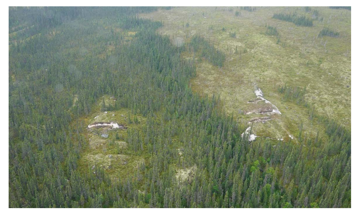
Figure 1. Aerial view at Ruby Hill West looking to the west of the RHW-1 (to the right) and RHW-2 (to the left) pegmatites and 2023 trenching. The RHW-2 trench is 30m long with the collar from RHW22-06 located near the southern end of the trench.

A series of 150m deep holes have been planned to target the outcropping spodumene bearing pegmatites recently identified during the limited summer field season. Drilling will predominantly target 3 areas – Ruby Hill West (RHW-2) and the Mikisiw (M-1 and M-2) outcrops