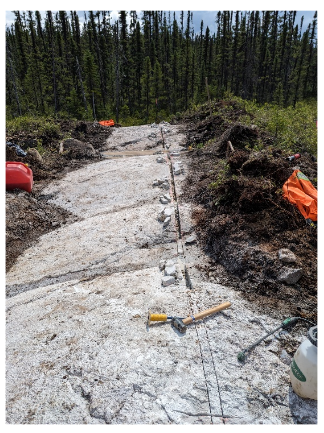
Figure 2. A substantial pegmatite outcrop at Ruby Hill West following removal of the layer of moss and vegetation (this photo looks to the south east). Drilling in the vicinity of this outcrop intersected 26.4m at 1.01% Li<sub>2</sub>O from 7.4m. This outcrop was discovered after the maiden drill program due to being under shallow cover.

Trenching in 2022 and 2023 exposed the 2 pegmatite intrusions but drilling in this upcoming program will test mostly the lateral and depth extent of RHW-2.