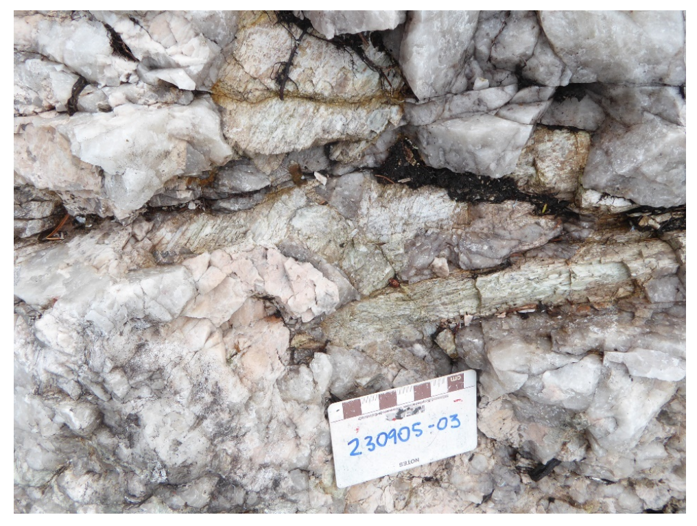
Figure 4. Spodumene crystals from the Mikisiw M-1 outcrop.