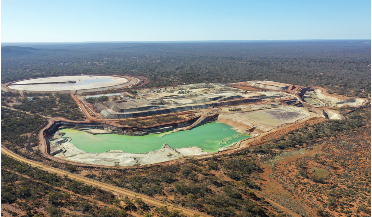
Figure 1: Jaurdi Gold Project on 20 July 2023