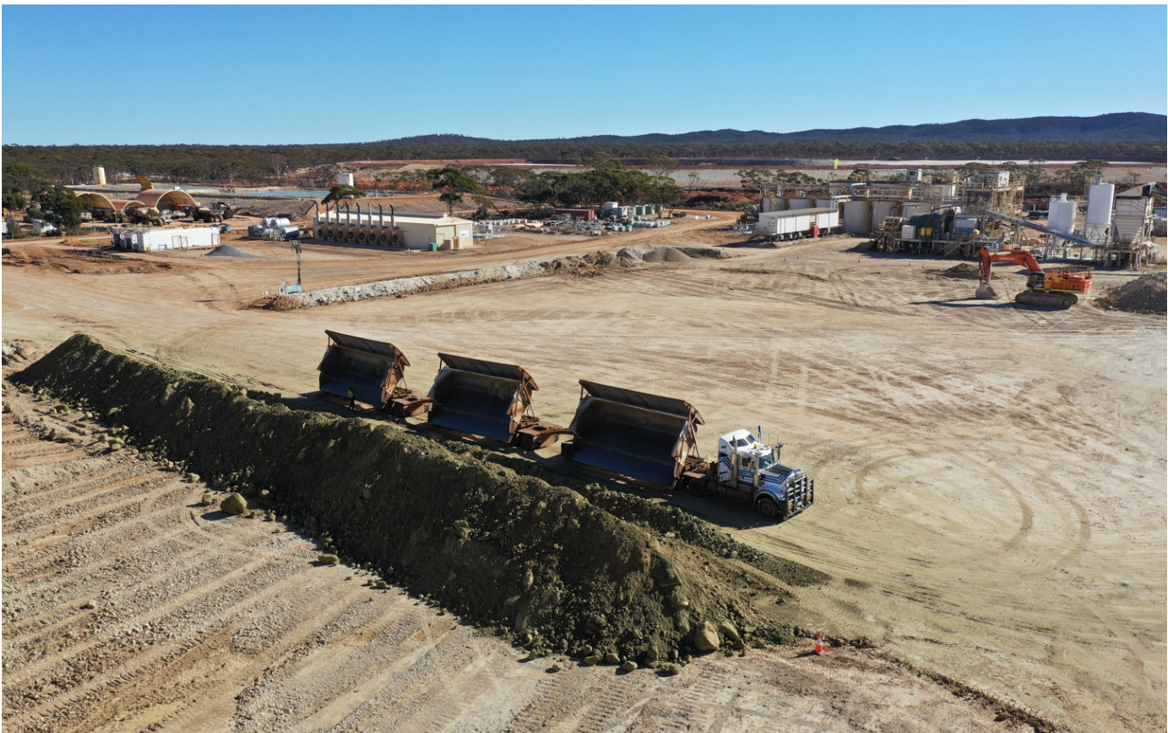
Figure 2: Geko Ore Stock Piles on ROM at Jaurdi on 18 July 2023