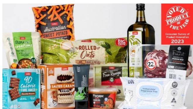
Coles Own Brand products received more than 100 product awards during the year including 11 of the consumer voted Product of the Year awards.