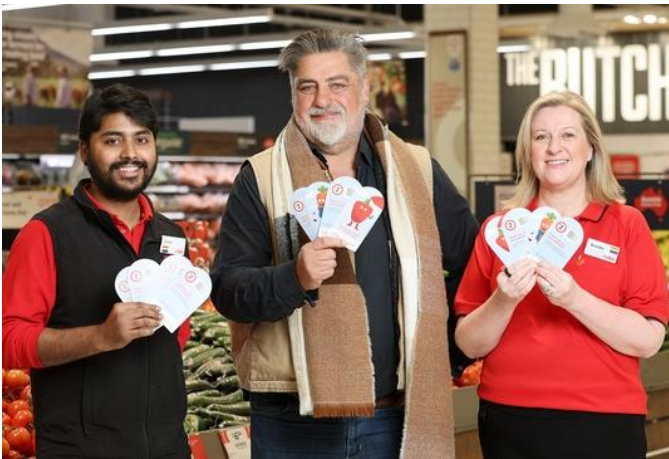
Coles supported the 2023 SecondBite Winter Appeal through the purchase of $2 donation cards or by customers making a donation of their choice in store.