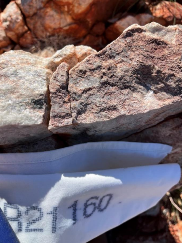
Figure 2: Rock sample R21160, collected from a 6-metre wide, 200m long pegmatite outcrop