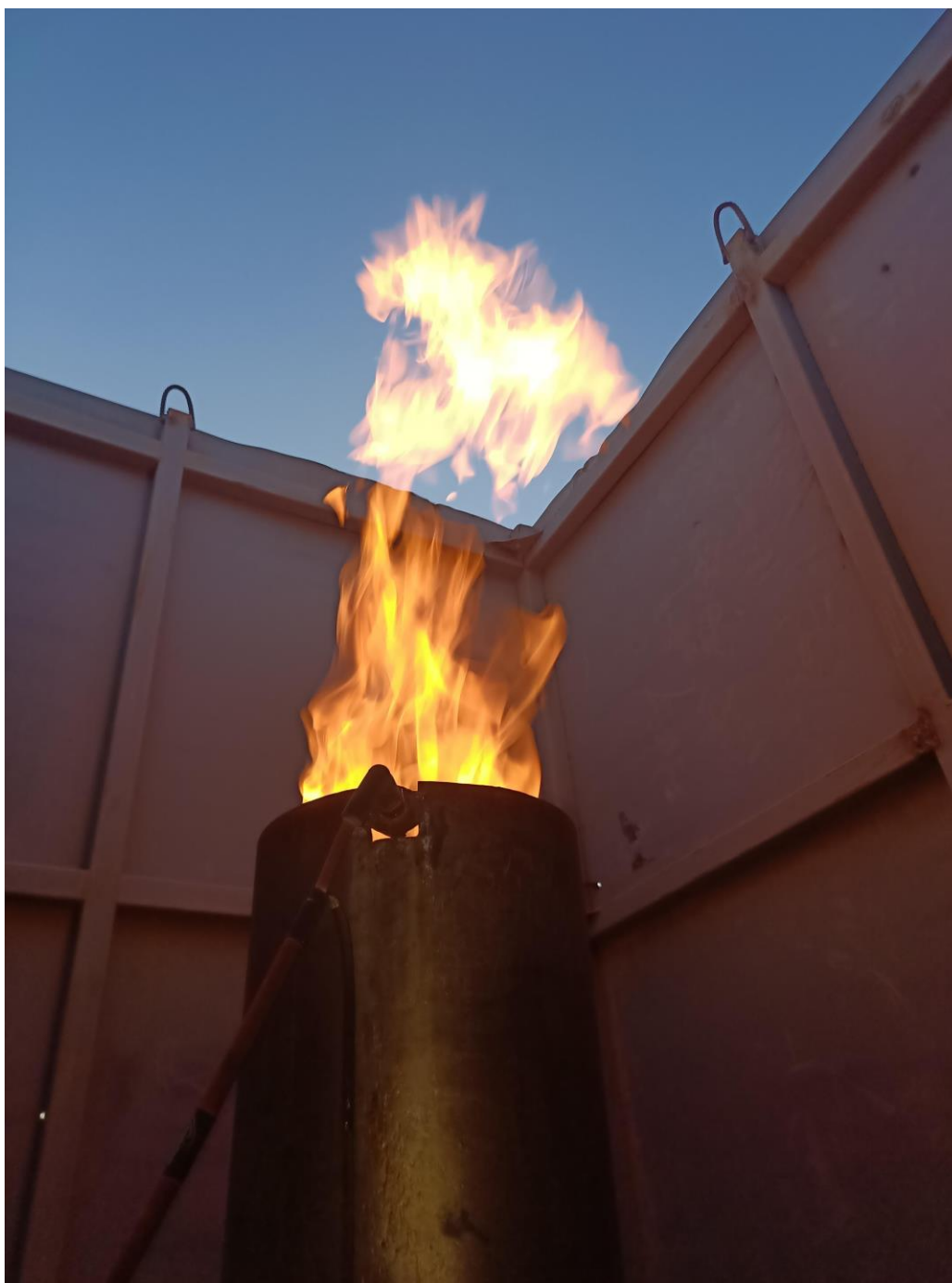
Recent flare at the Nomgon Pilot

The Big Slope-7 appraisal corehole has now been completed. The well was drilled to a depth of 666 metres, with drilling curtailed slightly ahead of the originally planned total depth due to difficult hole conditions. A total of 35 metres of coal and 7m of silty coal was intersected, with 1 Drill Stem Test (DST) conducted. The interpretation of the results of the DST will be announced in due course.