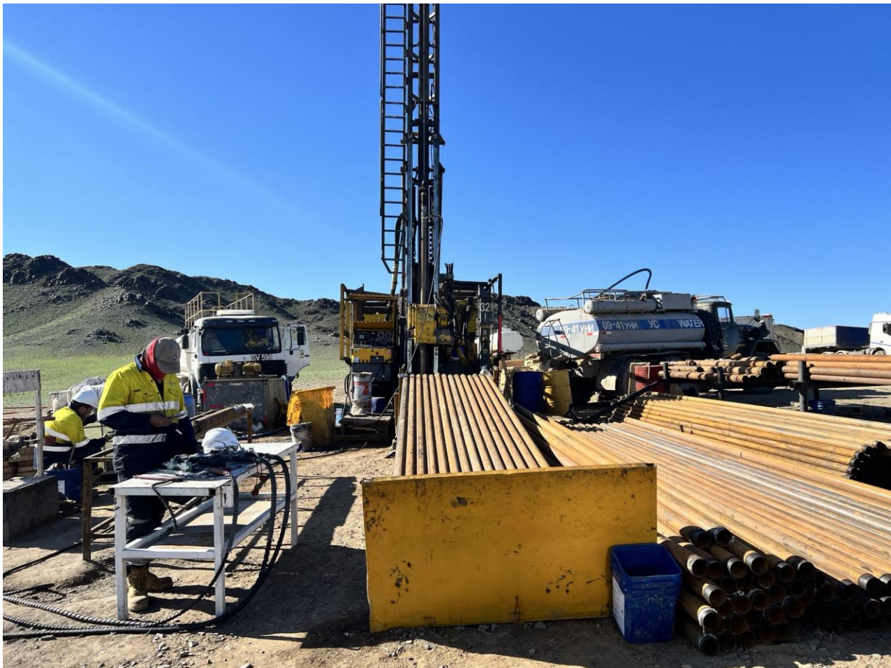
Erdene drilling rig at Big Slope 7

The well was drilled by Mongolian drilling contractor Erdene Drilling LLC and is the first of a number of wells it is contracted to Elixir for drilling in the region. The rig has now moved to a nearby location to the West of the previous well to drill a corehole: Big Slope Shallow-1, where it will appraise the shallower coals at deeper locations.