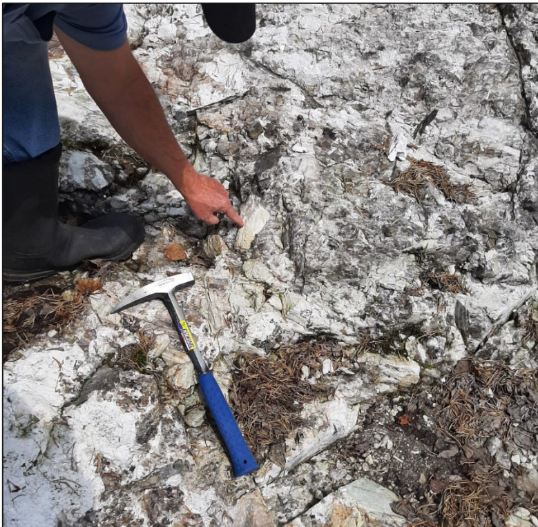
Figure 2: Inspecting pegmatite outcrop, Cadillac Project