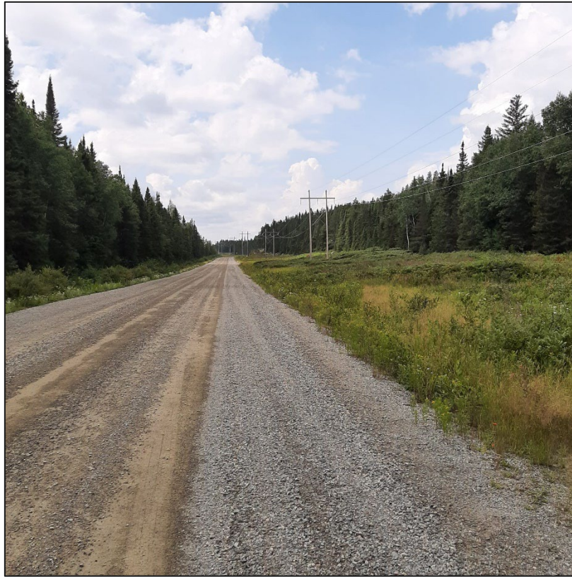
Figure 3: Access road and power line passing through the Cadillac Project