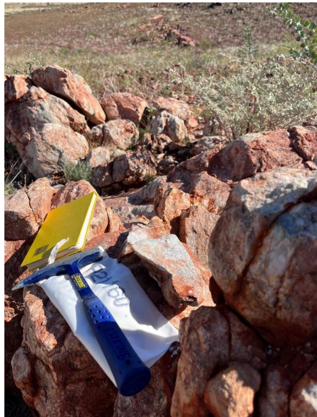
Figure 3: Pegmatite outcrop at rock sample R21160 location, with further pegmatite outcrops along strike (in background)