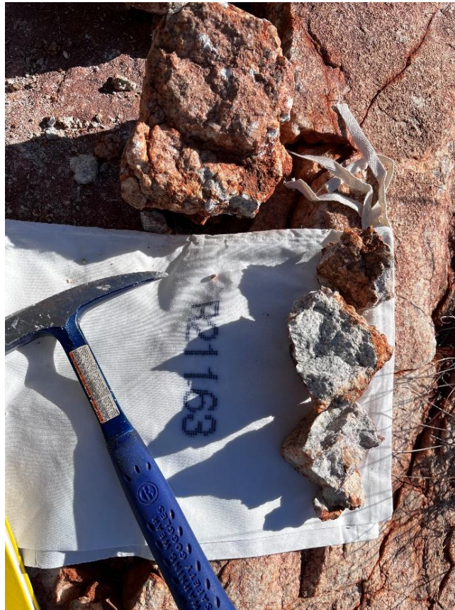
Figure 4: Rock sample R21163 on pegmatite outcrop

A broader exploration program, including mapping and sampling for lithium bearing pegmatites within the Company's Mt Sholl project area, adjacent to the recently announced discovery of high-grade lithium bearing pegmatites by GreenTech Metals Ltd (ASX: GRE) on the Ruth Well project 4,5 , is also in planning phases and will be undertaken in the near future.