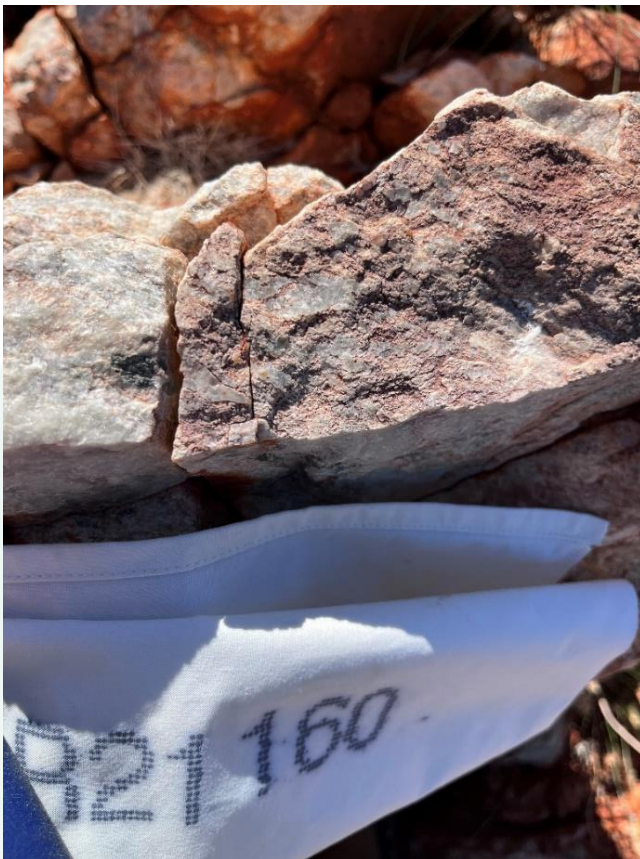
Figure 2: Rock sample R21160, collected from a 6-metre wide pegmatite outcrop