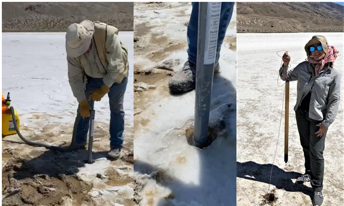
Figure 4: Resampling previous auger sample sites with hand pump