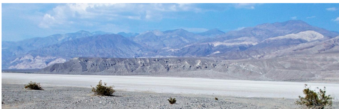
Figure 5: Three views of the salt playa at Liberty Lithium