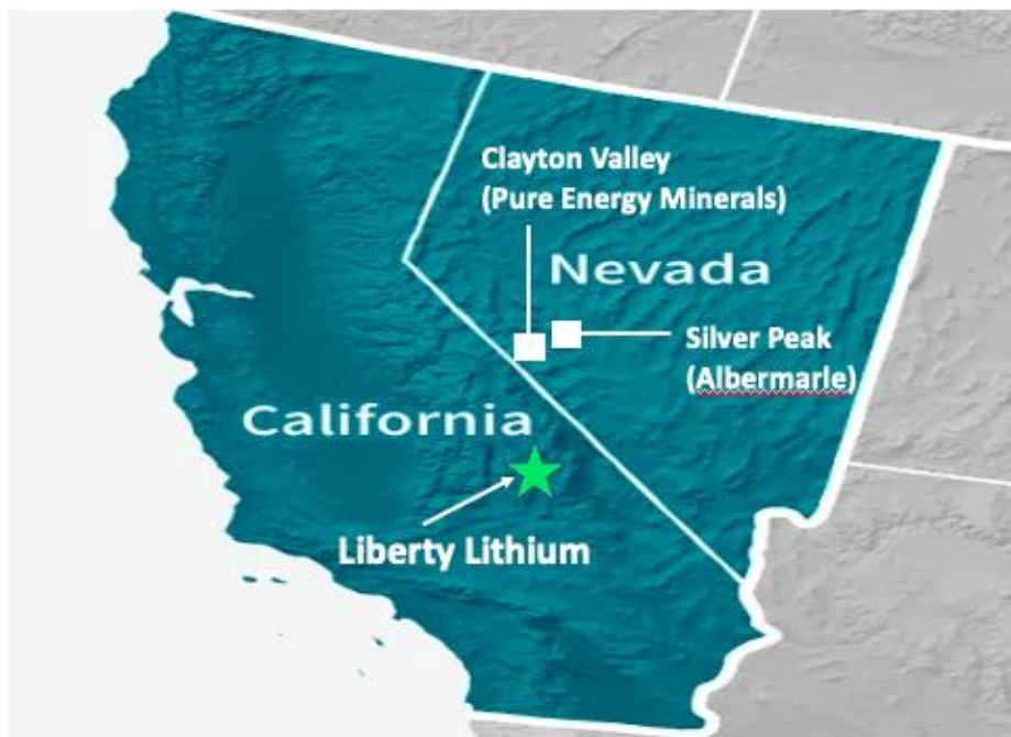
Figure 1: Location map of Liberty Lithium area (Jackrabbit Flat Project)

It's a sought-after project with many characteristics similar to Albemarle's producing Silver Peak lithium brine deposit in Clayton Valley USA and other Argentina brine projects. It is encouraging to note growing interest from end-users investing directly into projects making Liberty Lithium an attractive opportunity. Liberty Lithium is well located near a long life salt operation nearby. We are in final discussions now."