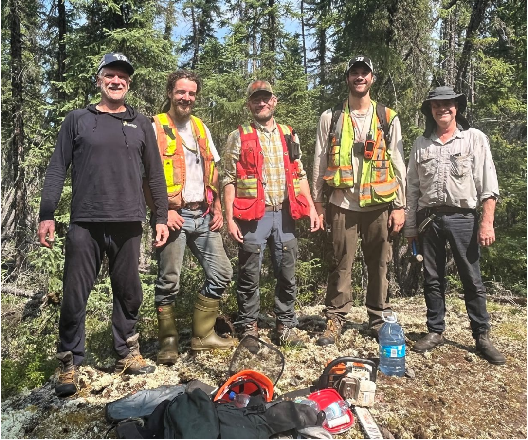
Figure 1: Field Personal on site at North Spirit Lithium Project