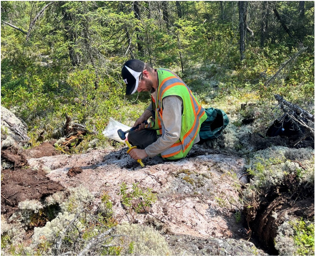
Figure 2: Initial Sampling of identified Pegmatites