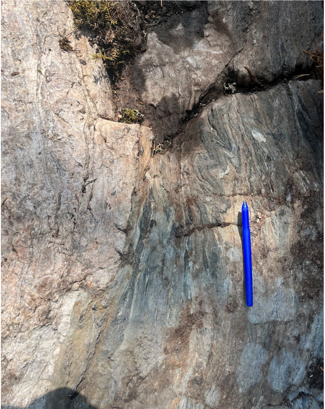
Figure 3: Pegmatite emplaced along a metasedimentary contact zone.