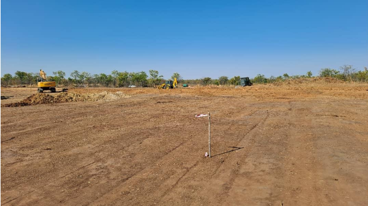
Figure 4 - Mukuyu-2 surface location

Following the rig and camp move to the Mukuyu-2 wellsite, the installation and commissioning of the new mud tank system which has now been delivered to site and the rig acceptance process will be undertaken in preparation to drill the Mukuyu-2 well.