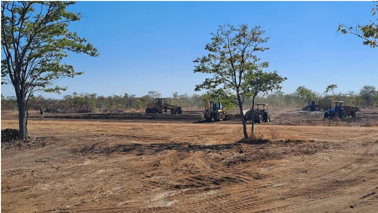
Figure 3 - Mukuyu-2 wellpad construction

Preparations for the drilling of Mukuyu-2 are well underway and are focused on leveraging lessons and insights from Mukuyu-1 to improve the logistics, drilling efficiency and operational risk profile of Mukuyu-2.