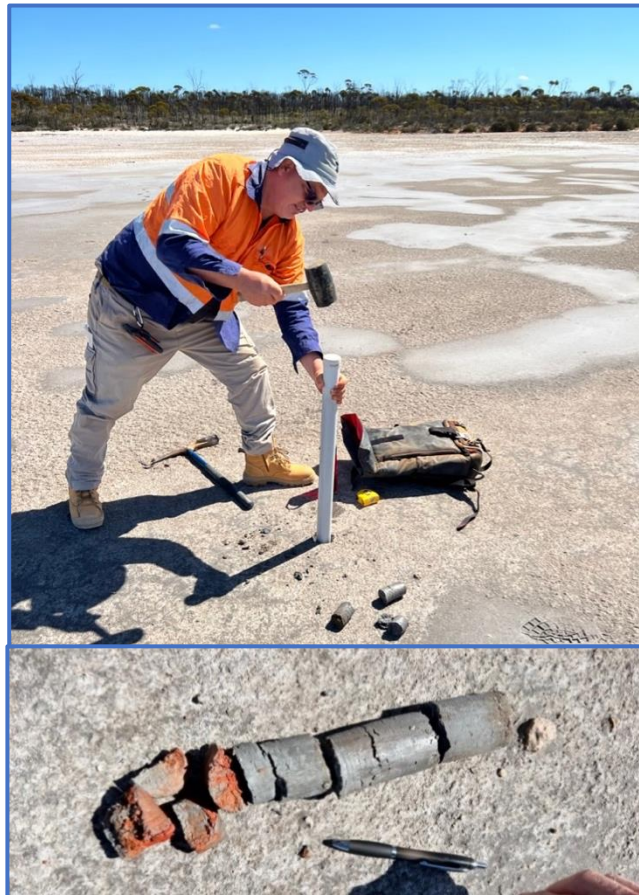
Figure 3. Lake Hope showing the push tube sampling method and an example of the lake clay from the push tube.

The resource was defined by 254 short, vertical drill holes (for 264.9 metres) drilled on a nominal 100 metre by 100 metre grid. Of these, 174 holes (for 215.67m) were drilled by a 70 mm screw hand auger and 80 holes were drilled using a 50 mm or 65 mm PVC push-tube hammered into the lake clays (Figure 3). Sample recovery was at least 95% and sample quality is considered good to excellent.