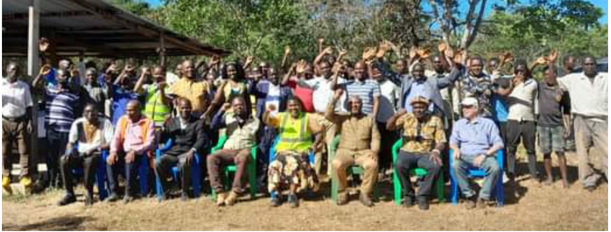
Photo 2. Hon. Monica Chang'anamuno (Minister of Mining) and Hon. Ibrahim Matola (Minister of Energy) with District chiefs and community members at the Kanyika mine site