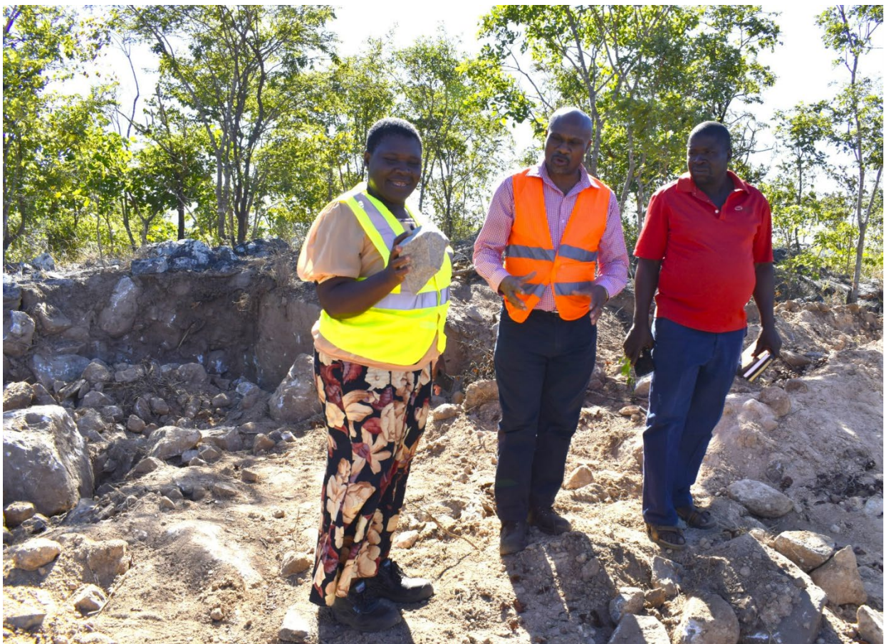
Photo 1. Hon. Monica Chang’anamuno (Minister of Mining) and Hon. Ibrahim Matola (Minister of Energy) at the Kanyika mine site

The Honourable Monica Chang’anamuno (Minister of Mining) commented on the cordial working relationship with the Ministry of Energy in respect of the Project, with the Honourable Ibrahim Matola (Minister of Energy) pledging to expedite the connection of electricity at the Kanyika mine site.