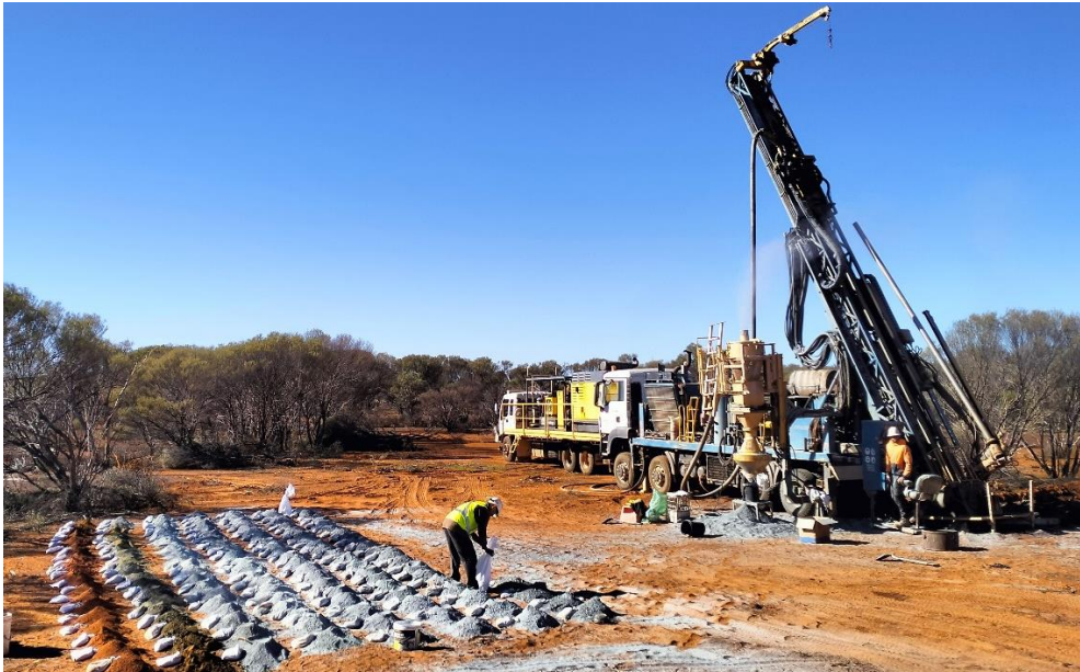
Figure 1 , Challenge Drilling RC rig onsite at Kookynie Gold Project

Carnavale Resources Ltd (CAV) is pleased to announce it has completed a program of RC drilling at McTavish East at the Kookynie Gold Project following up on strong, extensional high-grade gold results from previous shallow aircore drilling in the regolith.