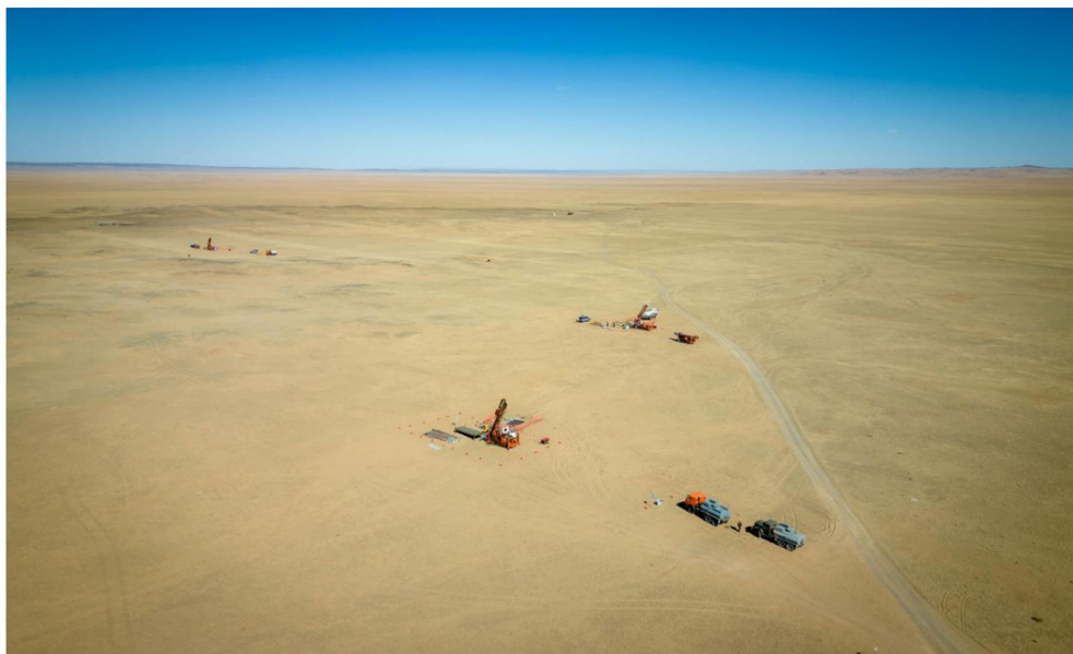
Figure 3 – Three diamond drill rigs operating at Stockwork Hill.