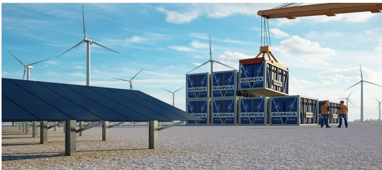
Figure 4 – 1MWh GridPacks

The stackable feature, coupled with the "plug and play" design, makes the GridPacks the obvious choice for BESS solutions to meet any future energy storage requirements. The Altech GridPacks are also designed without the requirement for any moving parts such as cooling fans, which are typically found in lithium-ion battery mega packs. This is a notable advantage, as end-users have raised concerns about the noise generated by mega packs, preventing them from being placed near residential areas. With the absence of any moving parts, the Altech GridPacks are practically maintenance-free and completely noise-free in operation, making them an ideal solution for noise-sensitive environments.