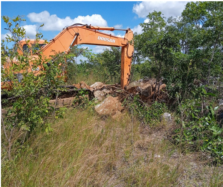
Figure 1. Sample collection at Kanyika mine site: 28 April 2023

The Company was assisted in this exercise by S.R. Nicholas and Crushing for Africa, and the final -40mm sample will be packed into 1-tonne bulk bags and despatched to Johannesburg using C.Steinweg Bridge, a well-known regional logistics company based in Lilongwe. In Johannesburg the sample will be further milled to effectively <1mm by EDS (Energy and Densification Systems). Thereafter, Geolabs Global will prepare a concentrate sample using milling, desliming, magnetic separation, flotation, dewatering and drying. The dried sample will then go to TCM Research who will conduct an extensive program of metallurgical test work that will generate full-scale design parameters for the refinery while producing marketing samples for customer evaluation.