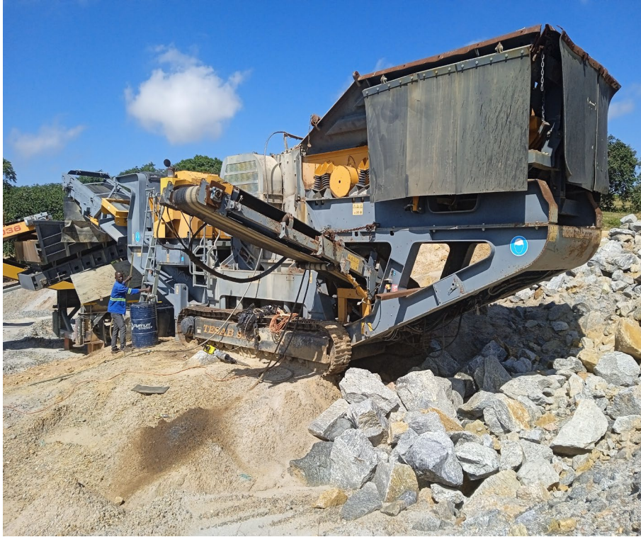
Figure 2. Crushing Kanyika ore for shipment: 29 April 2023