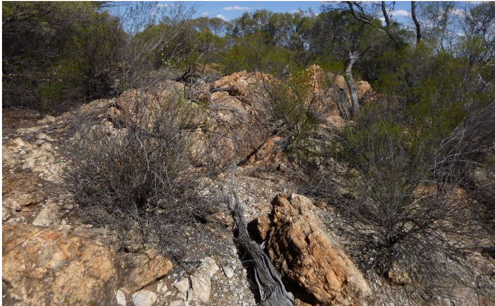
Gently north dipping pegmatite dyke at Emerald SE (location 268750E, 6723285N).

This announcement is authorised by the Board of Venus Metals Corporation Limited.