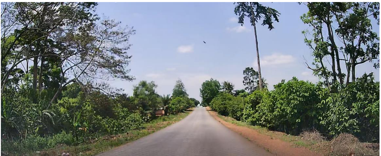
Indicative Road Condition at Issia between site and Port of San Pedro