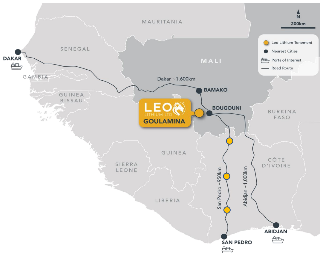
Proposed Haulage Routes from Goulamina to Port with Photo Location References

“Pleasingly, we have received significant interest from numerous capable and established trucking contractors for the trucking tender and we expect to finalise the trucking contract in the near-term.”