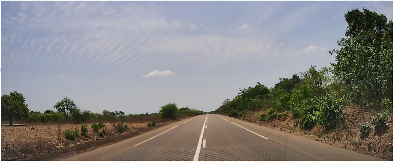
Indicative Road Condition at Tingrela between site and Port of San Pedro.