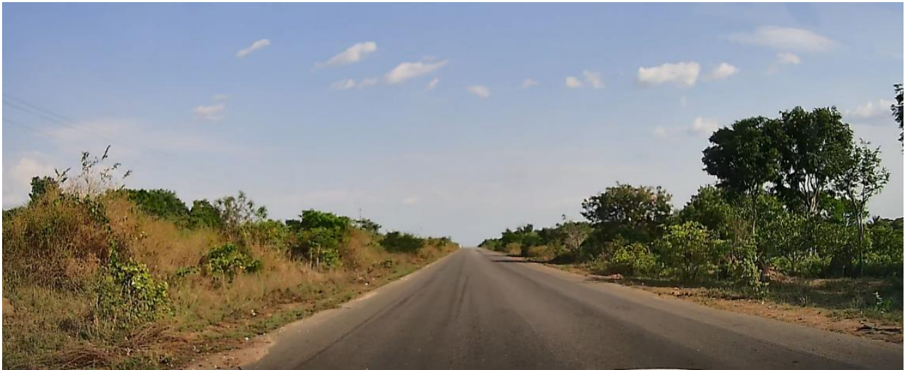
Indicative Road Condition at Seguela between site and Port of San Pedro.