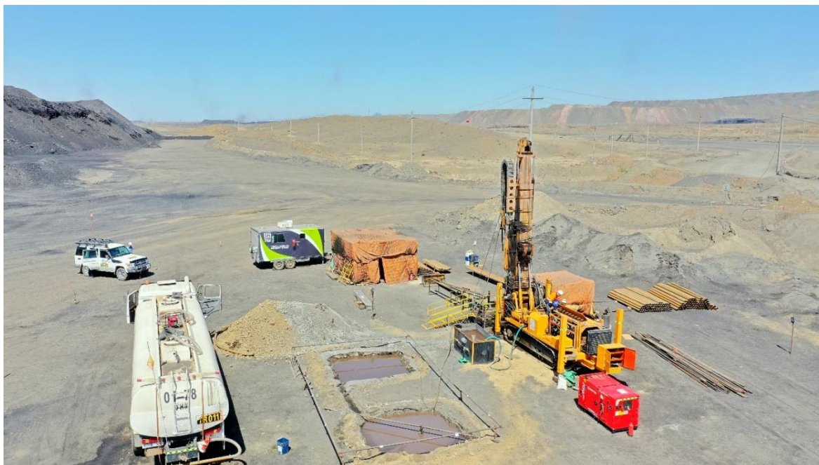
Figure 2: Snow Leopard exploration drill site at the Gurvantes XXXV Coal Seam Gas Project

then expanded to include the drilling of an additional well (Snow Leopard-05) following encouraging results from the initial drilling program.