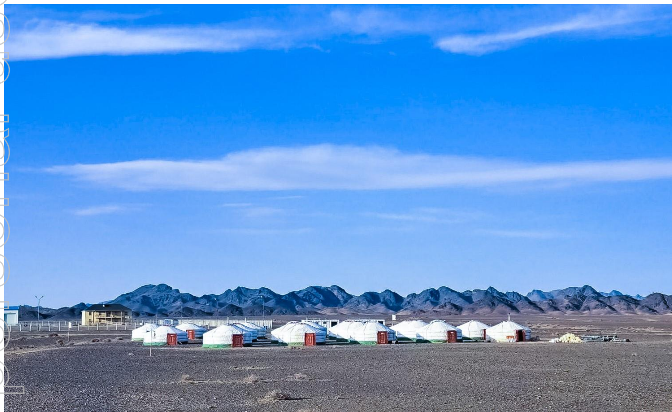
Figure 3: Newly constructed exploration camp to be utilised for 2023 Pilot Well Program

The Pilot Well Program is expected to take approximately eight weeks to complete the drilling of the three production wells and installation of pumps. The production wells will then be tied into the surface facilities, which includes metering skids, a flare stack and water disposal facilities, and then placed on pump to commence the process of pressure drawdown prior to gas breakout. Once commissioned, the pilot wells will be operated for approximately six months in order to understand the water and gas production profiles.