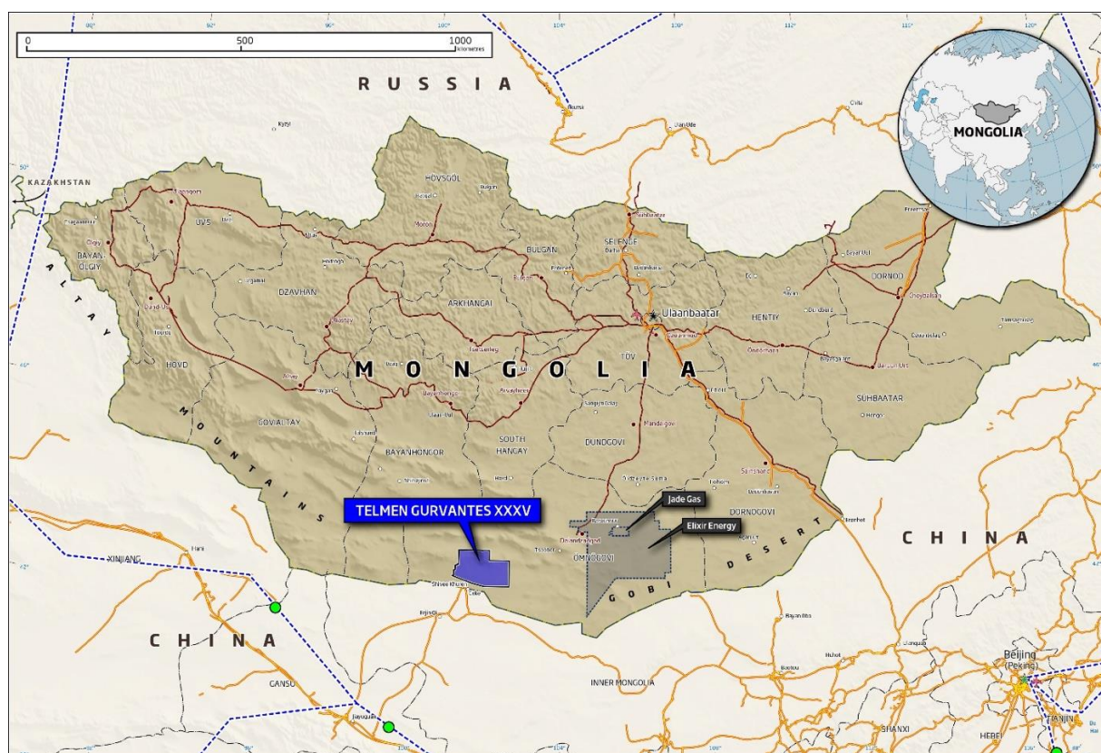
Figure 1: Location of the Gurvantes XXXV Coal Seam Gas Project, South Gobi Desert of Mongolia

The Gurvantes XXXV CSG Project covers a very large area of 8,400 km 2 . Within the Project area, multiple very thick, high quality coal seams outcrop at the surface and extend along an east-west strike for approximately 150km. The Gurvantes XXXV CSG Project area is situated less than 20 km from the Chinese-Mongolian border and close to the extensive Northern China gas transmission and distribution network. Notably, it is the closest of Mongolia's CSG projects to China's West-East Gas Pipeline and is proximate to several large-scale mining operations with high energy needs. As such, the Gurvantes XXXV CSG Project is ideally situated for future gas sales to support both local Mongolian, as well as Chinese, energy requirements.