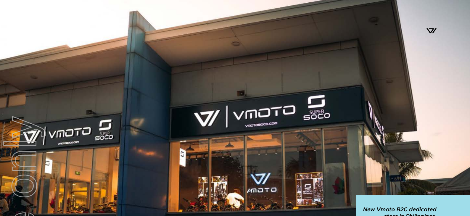
New Vmoto B2C dedicated store in Philippines.

The chart below illustrates the Company's historic international unit sales, by quarter, for the current and previous financial years: