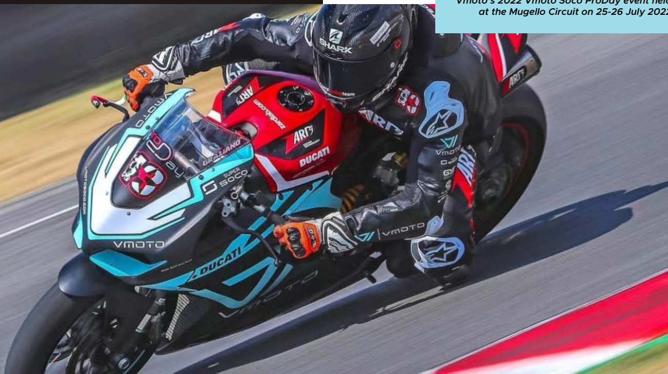
Vmoto's 2022 Vmoto Soco ProDay event held at the Mugello Circuit on 25-26 July 2022

Following the productive exhibition at WDW, in July 2022, Vmoto successfully held its second annual Vmoto Soco ProDay at the Mugello Circuit in Tuscany, Italy; a racetrack famous for its fast curves and incredible slopes revered by motorcyclists. The Company successfully hosted over 300 people, including Vmoto's distributors, partners, professional riders, media, and motorcycles enthusiasts. The Company also received significant exposure for its brands and products through the media spotlight, with a significant number of broadcasts reporting on the event.