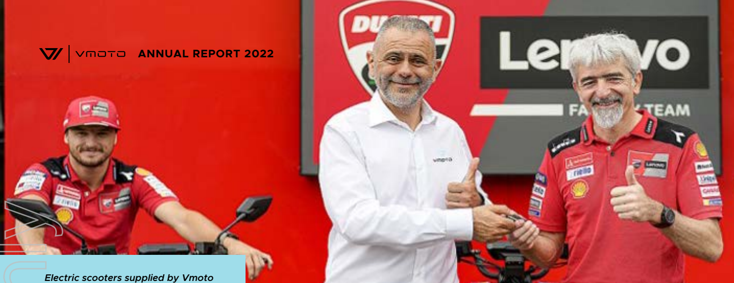
Electric scooters supplied by Vmoto to Team Ducati Corse for the MotoGP