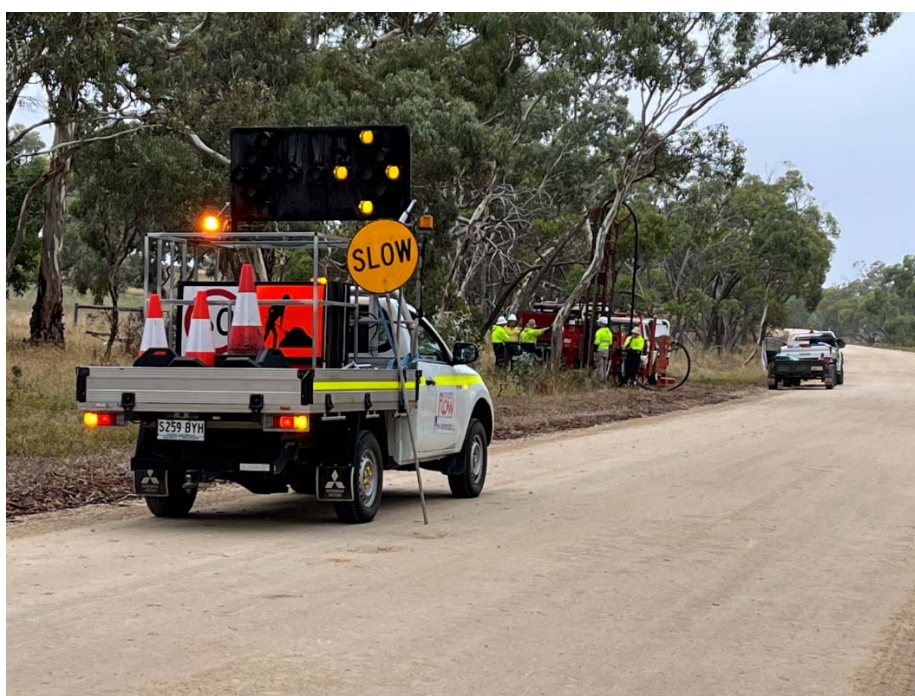
Image 2: Roadside Drilling Team on Bangham Road south of Bordertown with traffic control management in place

However, whilst Koppamurra clays display ionic character, and the deposit shares a number of similarities with both ion adsorption clay deposits and volcanic ash fall placer deposits, there are also a number of differences, with further work required before a genetic model for REE mineralisation at Koppamurra and the broader Murray Basin can be conclusively defined. In addition, further work is required to better define metallurgical recoveries, process flow sheets, effective mining methods, and project economics.