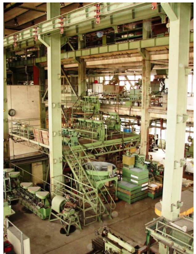
Figure 1 – UVR-FIA bulk grinding (LHS) and flotation (RHS) laboratory in Germany