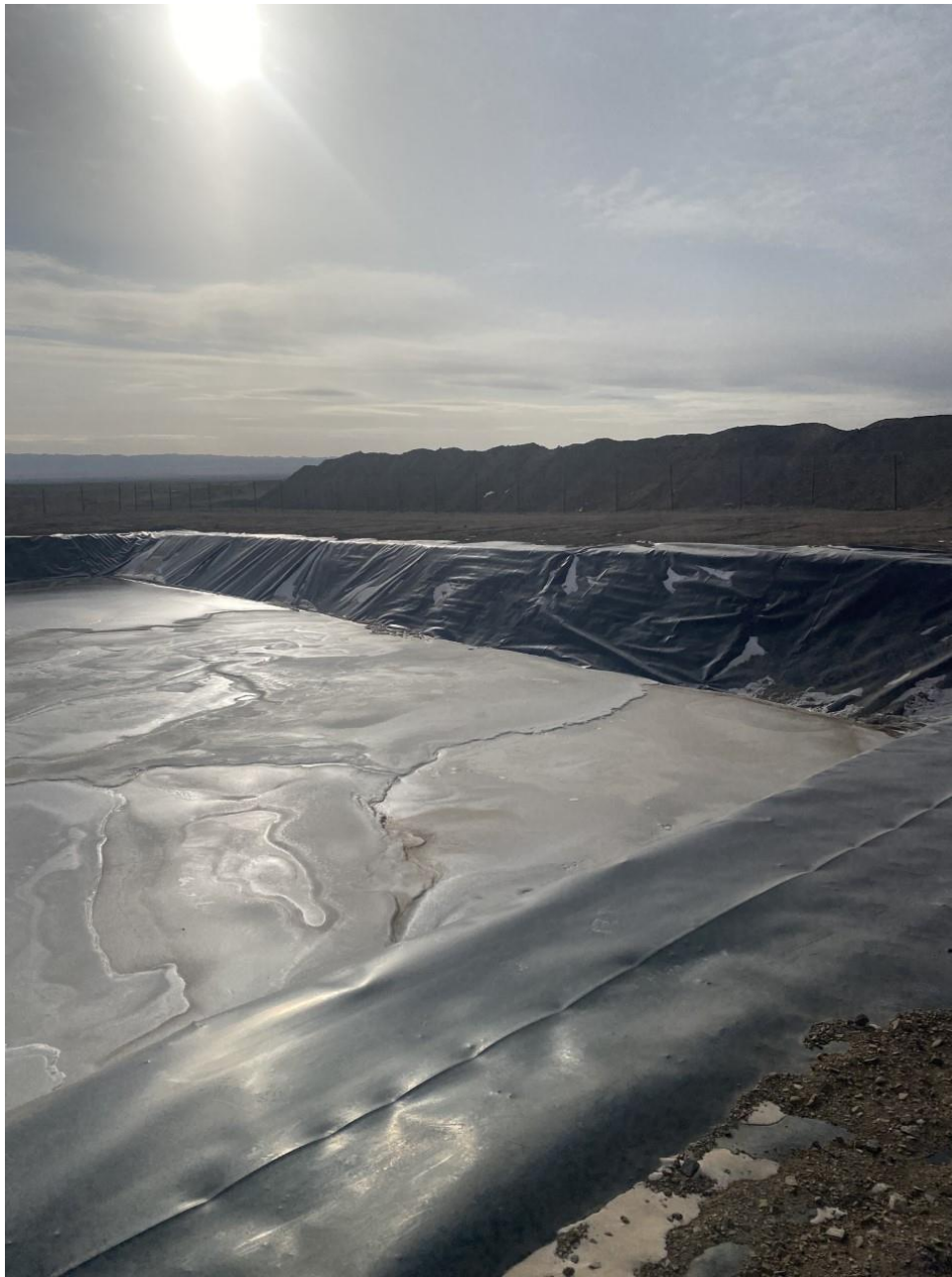
Frozen Produced Water at Nomgon Pilot Plant

With now over 80 days of production data, Elixir is starting to interpret a clear trend on the longer producing Nomgon-9 well. The decreasing reservoir pressure due to coal dewatering and consequent increasing gas rate are enabling the Company to begin estimating an early stage “type-curve”, which will be a key input into assessments of commerciality. These will be completed in the coming months.