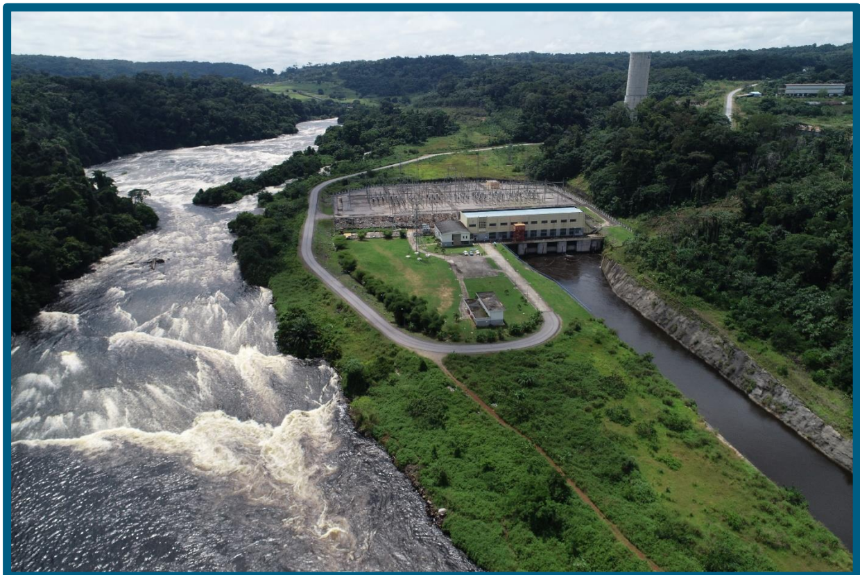
Figure 3: Grand Poubara Hydropower Station