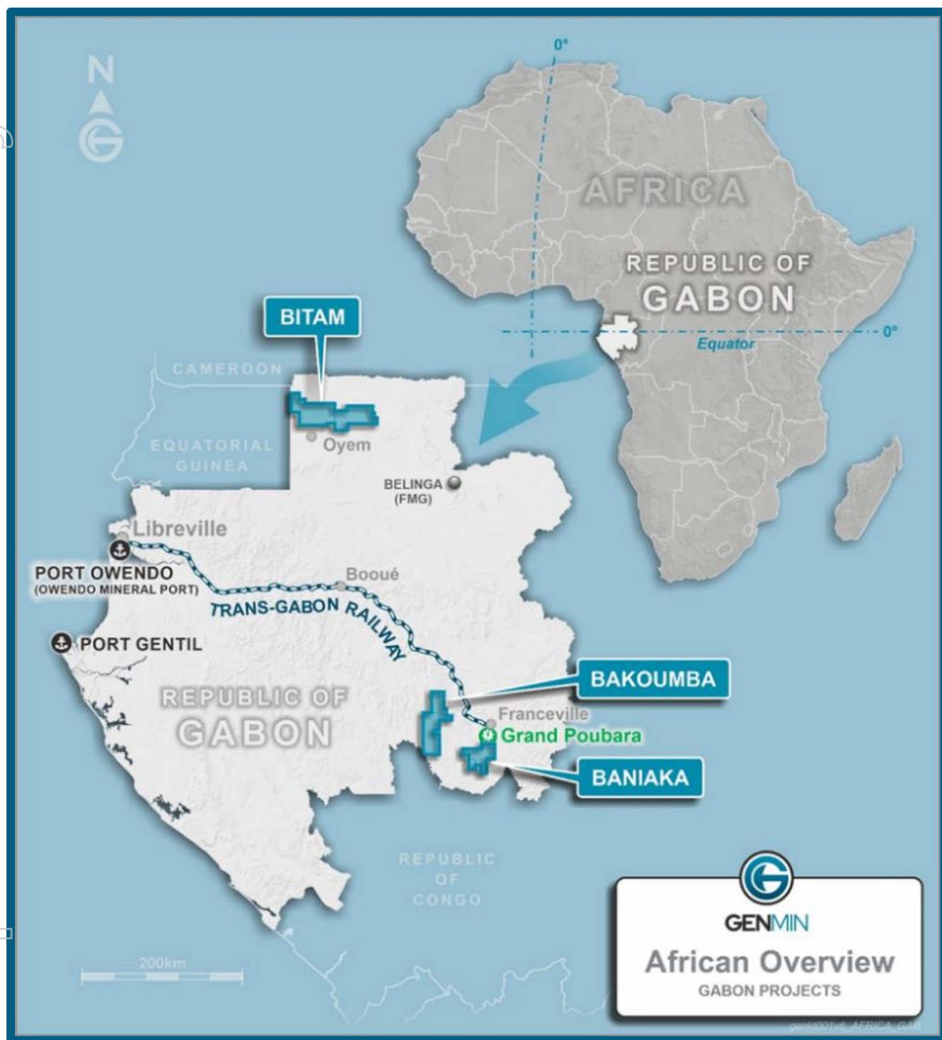
Figure 1: Location of Baniaka