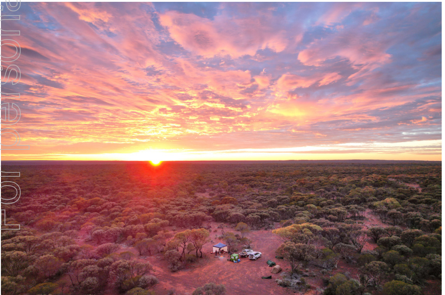
Pictured above & front cover: Mt Bevan Joint Venture, Western Australia