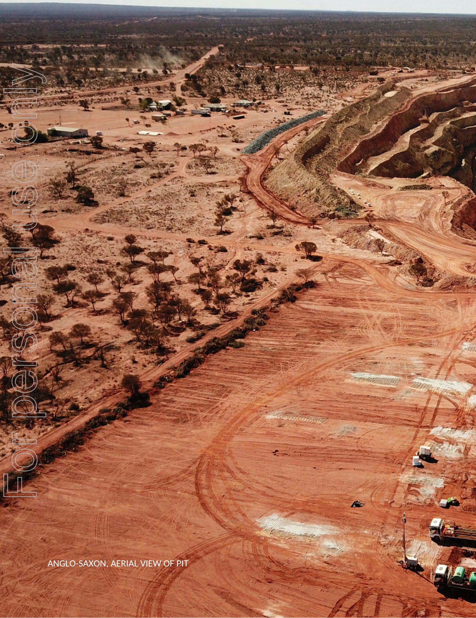
ANGLO-SAXON, AERIAL VIEW OF PIT