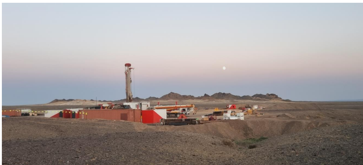
Figure 2: Major Drilling at Nomgon IX