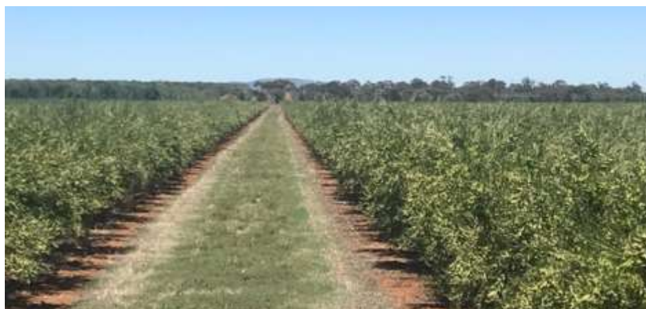
A view of the 2019 planting ready for harvest

As previously reported, the replanting programme was completed in March 2022. This marks the end of the capital expenditure associated with this project although it is noted that the recently planted areas will continue to incur some maintenance costs before they enter production.