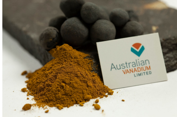
Figure 4: Sample of V_2O_5 precipitate generated from pilot program alongside roasted pellets and a vanadium ore sample.

AVL produced high-purity 99.5% V_2O_5 marketing samples during the final stage of metallurgical testing for the BFS. The feed materials for this sequence of pilot programs comprised two composites of drill core, designed to be indicative of the average first five years of production and life of mine production. A sample of V_2O_5 , alongside AVL's pelletised vanadium concentrate and a sample of ore is shown in Figure 4.