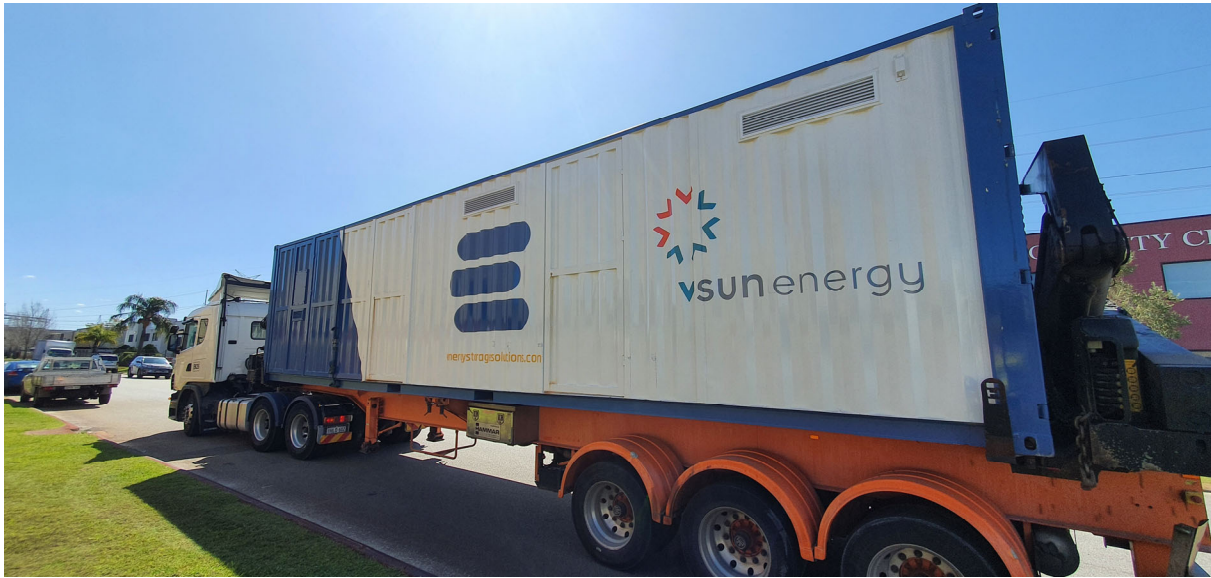
Figure 7: VRFB en route to testing facility in Perth

diesel generator powered bore fields, but also offer substantial reductions in operating hours for service personnel. These two significant benefits indicate a potentially rapid growth market segment for this robust technology.