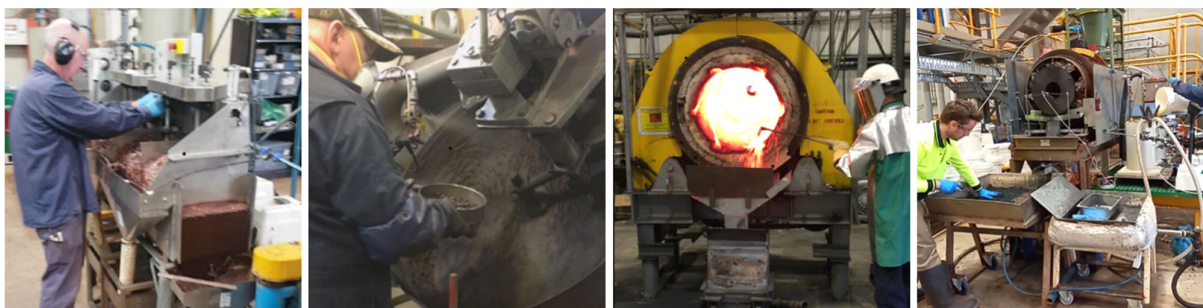
Figure 6: AVL's process includes reverse flotation, pelletisation, salt-roasting and leaching; demonstrated at full pilot-scale from left-right

The patent application also covers a nano-filtration and solvent extraction stage for producing an ultra-high purity vanadium as a value-added product. The feed for this operation is the wash solution generated in the previous step. The nanofiltration stage upgrades the vanadium content of the solution, solvent extraction removes impurities. The V_2O_5 product from this process will have a purity of >99.9%.