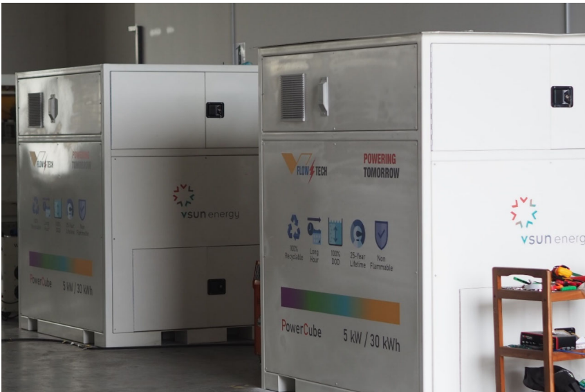
Figure 8: VSUN Energy branded V-Flow Tech 5kW/30kWh VRFBs

Three 5kW/30kWh VRFBs manufactured by AVL's Singaporean partner V-Flow Tech arrived in Perth in September 2021. AVL and VSUN Energy have previously signed an MOU with V-Flow for vanadium pentoxide offtake, vanadium electrolyte supply, VRFB sales, installation, service and maintenance.