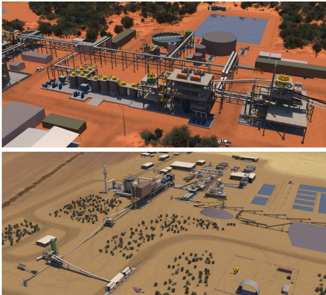
Figure 3 Top: CMB layout, Bottom: Processing Plant layout

For full details of the BFS, please see ASX announcement dated 6 April 2022 'Bankable Feasibility Study for the Australian Vanadium Project'.