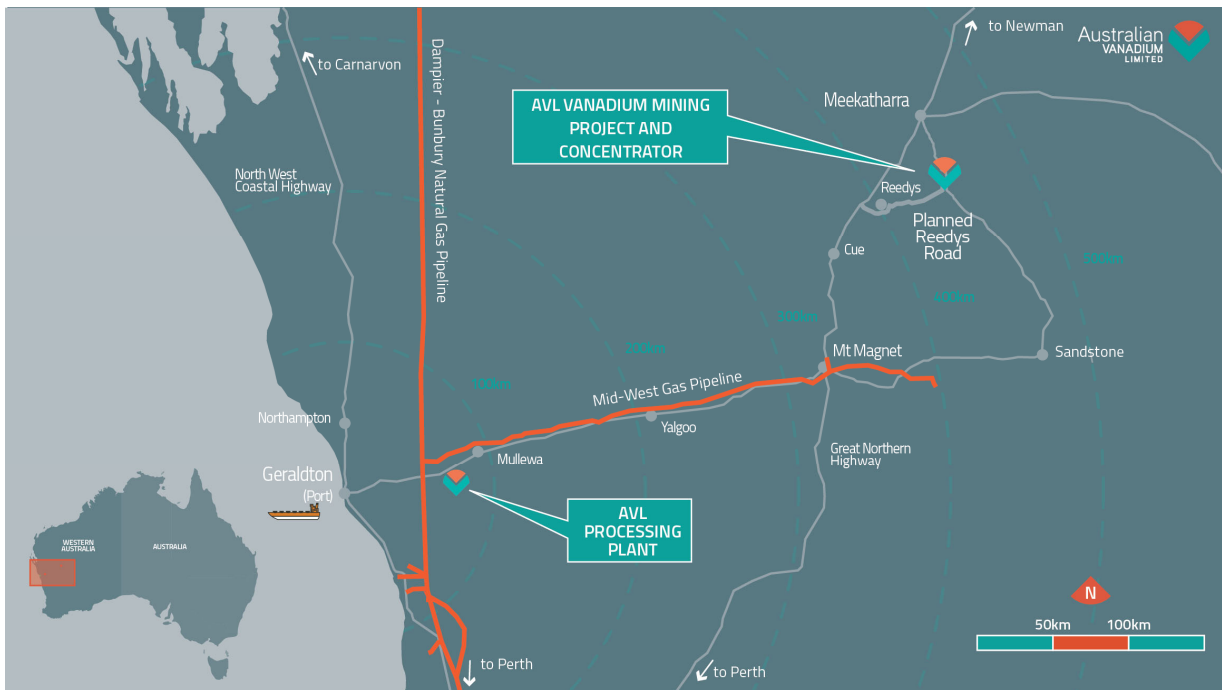
Figure 1: Location of The Australian Vanadium Project

The Project is based on a proposed open cut mine of the Vanadium Titanium Magnetite (VTM) Orebody and a crushing, milling and beneficiation plant (CMB) and a vanadium processing plant. Concentrate produced at the CMB will be transported to a vanadium processing plant located near Geraldton for final conversion to high quality vanadium pentoxide (V 2 O 5 ) for sale or further conversion and use in steel and energy storage, catalyst, chemical and defence applications. The coastal processing plant location is a key strategic differentiator to all current global primary vanadium producers, utilising the unique gas, road and port infrastructure of the world class mining region of mid-western Western Australia.