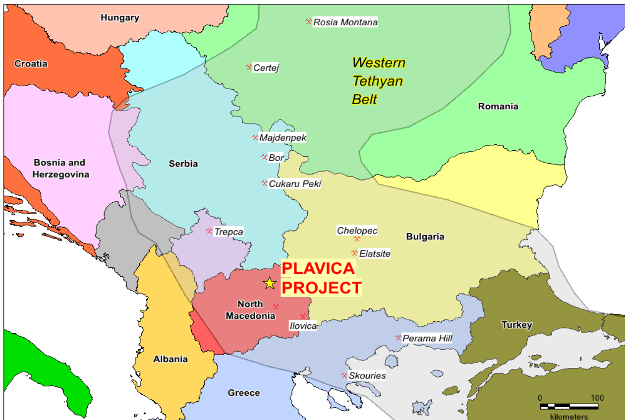
Figure 1: Location of Plavica Gold-Copper-Silver Project, Republic of Macedonia

Figure 1 shows the location of Plavica Gold-Copper-Silver Project in the Republic of Macedonia.