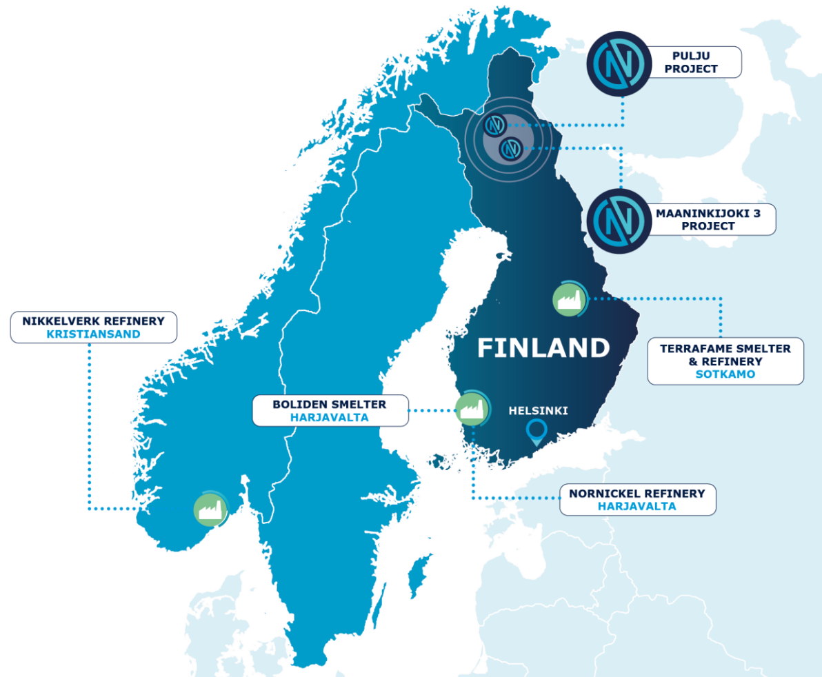
Figure 2: Location of Pulju Nickel Project and Europe's entire nickel smelting and refining capacity

Pulju is located 195km from Boliden's Kevitsa Ni, Cu, Au-PGE mine and 9.5Mtpa processing plant in Sodankyla, Finland. Kevitsa provides feed for the 19ktpa Harjavalta smelter which is approximately 950km to the south and processes concentrate from Kevitsa's low grade disseminated nickel sulphide ore (Resource Ni grade ~0.21%). Europe's only other smelter is Terrafame's 37ktpa Sotkamo smelter which is located 560km from Pulju.