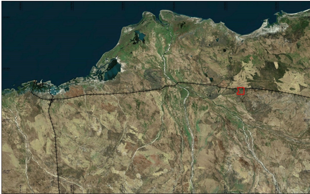
Fig.2.0 Project Location.