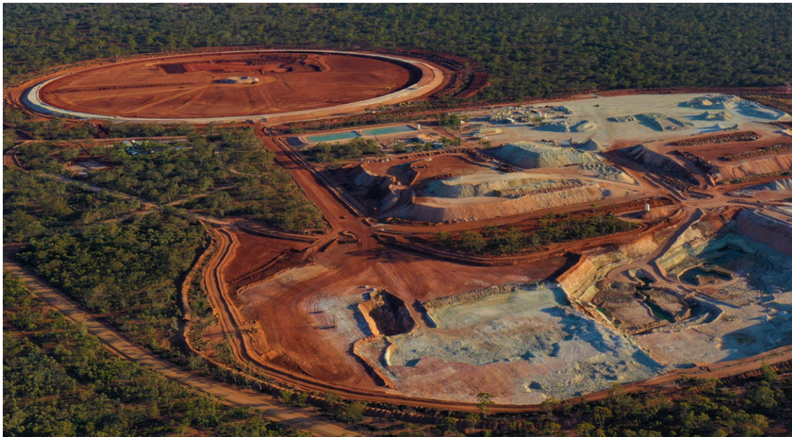
Figure 2 – Lost Panel 4 and Jaurdi TSF on 12 January 2022