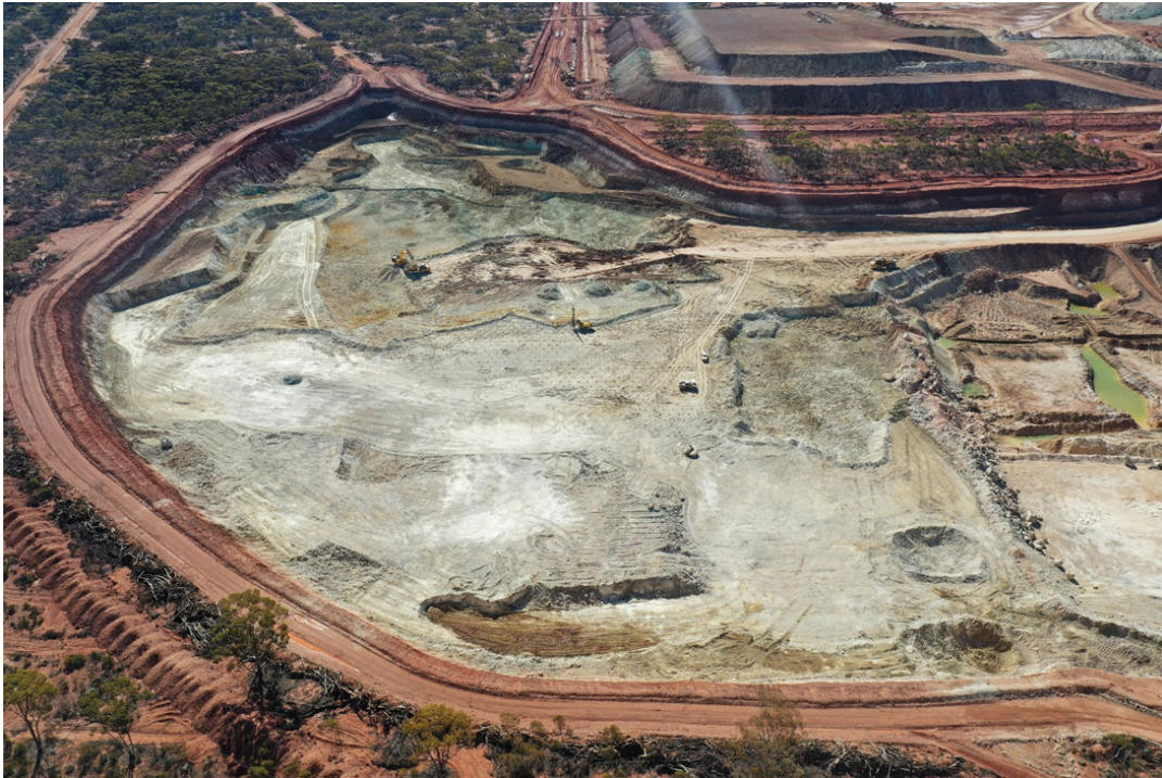
Figure 1: Lost Dog Panel 4 on 25 July 2022

The Jaurdi mill processed a record 791,000 DMT for the year and produced 29,770 ounces of gold. Throughput was 38% higher than FY 2021 and 58% higher than the 2018 PFS numbers.