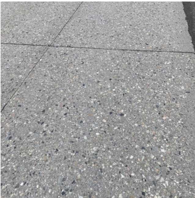
Figure 5 Mid-Section -Silica Fume Slab - 12 months Surface worn off, Scaling, Pitting, Aggregate Pop Outs