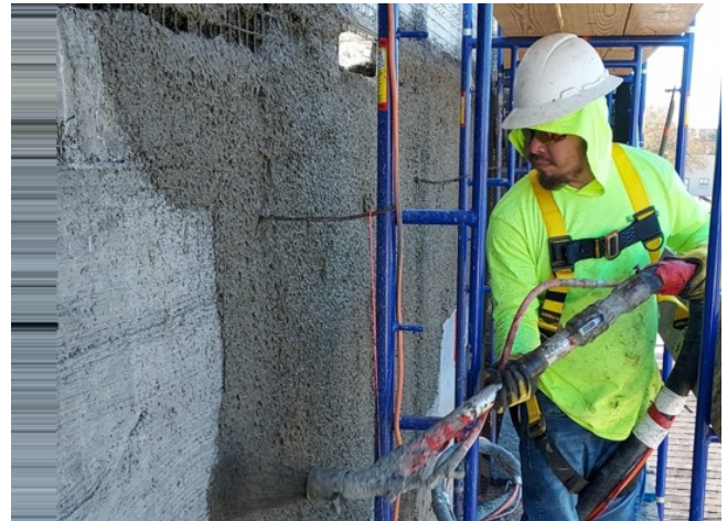
Figure 8. Shotcrete mix with EdenCrete® filling and fully encapsulating the wire mesh