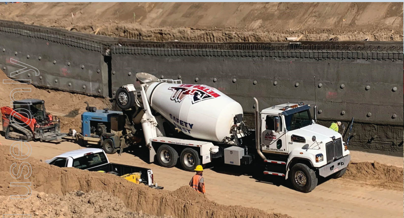
Construction of EdenCrete® enriched concrete retaining walls on Central 70 project in Denver, Colorado