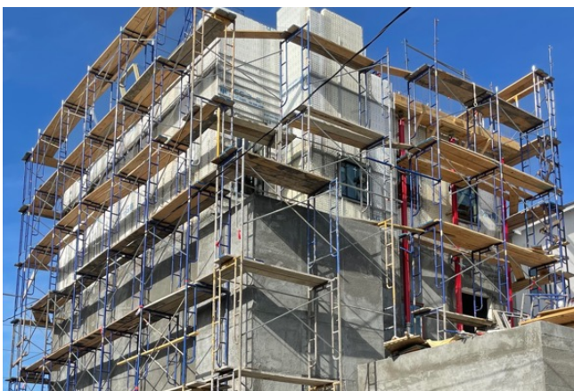
Figure 7. 4-storey SCIP residential home in Houston under construction and including EdenCrete®

The use of EdenCrete® was specified by the general contractor at 1/4 gallon/cubic yard (approx. 1.2 litres/ cubic metre) of concrete for this ongoing project. EdenCrete® was used to take advantage of the improved rheology of the shotcrete mix, allowing the mix, which pumps and finishes exceptionally well, to be easily placed, filling and fully encapsulating the 2-inch wire mesh opening.[see Figure 8] . This SCIP structure delivered a non-combustible building that does not require a fire sprinkler system.