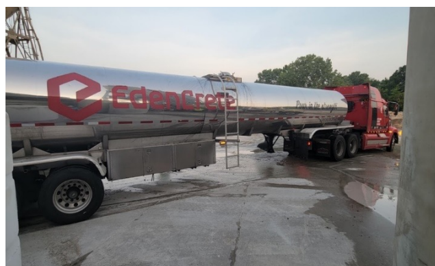
Figure 1. Initial EdenCrete® order to Delta Industries being delivered.

In addition to using EdenCrete® in shotcrete applications, Delta has advised that it also intends to trial EdenCrete® in other concrete mixes for use in a wider range of different applications, including where fresh property benefits, hardened property benefits, and improved durability and sustainability are required.