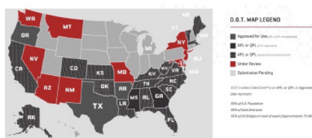
Figure 3. Current Status of US DOT Approvals of EdenCrete® Products

Alabama, Alaska, Arkansas, California, Colorado, Florida, Georgia, Kansas, Kentucky, Louisiana, Maine, Massachusetts, Mississippi, North Carolina, Oklahoma, Oregon, South Carolina, Tennessee, Texas, Vermont, Virginia and West Virginia; and [see Figure 3].