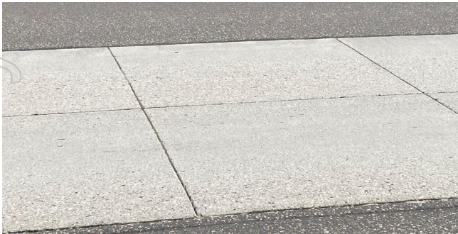
Figure 6 Mid-Section- EdenCrete® Slab – 12 months

Concrete surface partially worn off, No Scaling, No Surface Damage, No Pitting or Aggregate Pop Outs, No Rutting, No Joint Rot