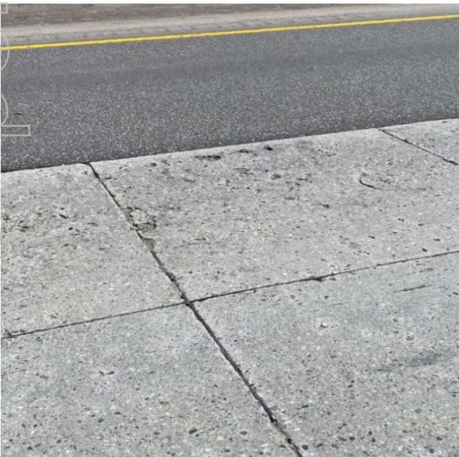
Figure 4 Mid-Section- Reference Slab - 12 months Severe Surface Damage, Joint Rot, Pitting, Pop Outs

slabs over the full 3 years. This would be of great assistance to Eden in its efforts to extend the existing EdenCrete® market footprint further into the highways and bridges through state and federal US Departments of Transportation, and into the broader US infrastructure market.