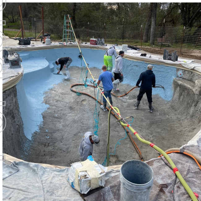
Figure 2. A typical US exposed aggregate, swimming pool finishing mix being applied.

Following successful trials in February 2022, Eden started to receive a growing number of orders from contractors in 7 states [Colorado, Georgia, North Carolina, Florida, Texas, New Mexico and California], for use in exposed aggregate pool mixes for finishing swimming pools [see Figure 2]. In March 2022, Eden received its first large order, worth approximately A$ 416,050 [US$311,040], sufficient for finishing for approximately 5,000 swimming pools, to be supplied progressively over a 12 month period.