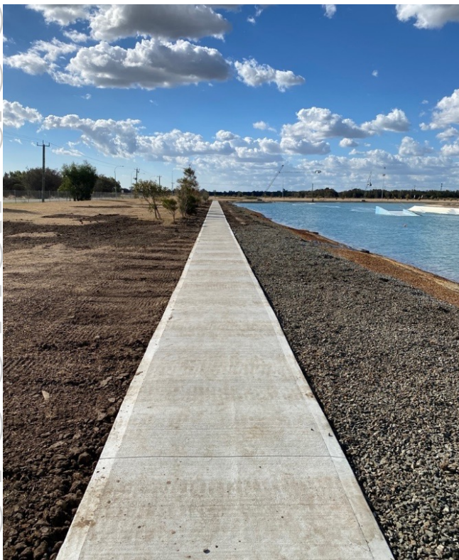
Figure 9 Concrete pavement (including EdenCrete®) at Perth Wake Park