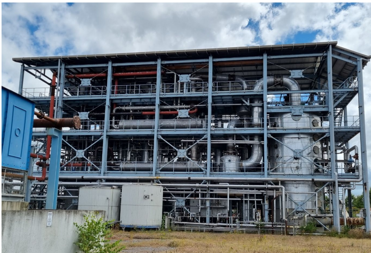
Leaf Resources Limited's replacement equipment in New Zealand, May 2022

Key components will be ready for shipment in the September 2022 quarter. It is anticipated that post shipment and subsequent rebuild at its new Queensland site, commissioning will take place in the March 2023 quarter, with sales of the first pine chemical expected to commence during the same quarter.