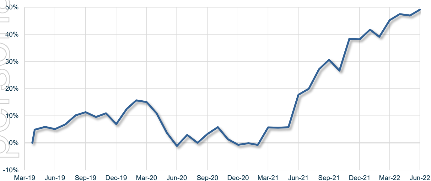
Figure 3: Trailing Period Net Returns to 30 June 2022 1, 2